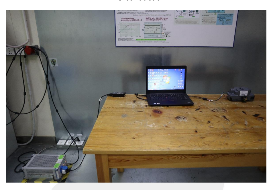
DTS radiation L