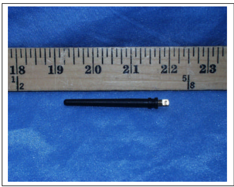
Page 48 of 49