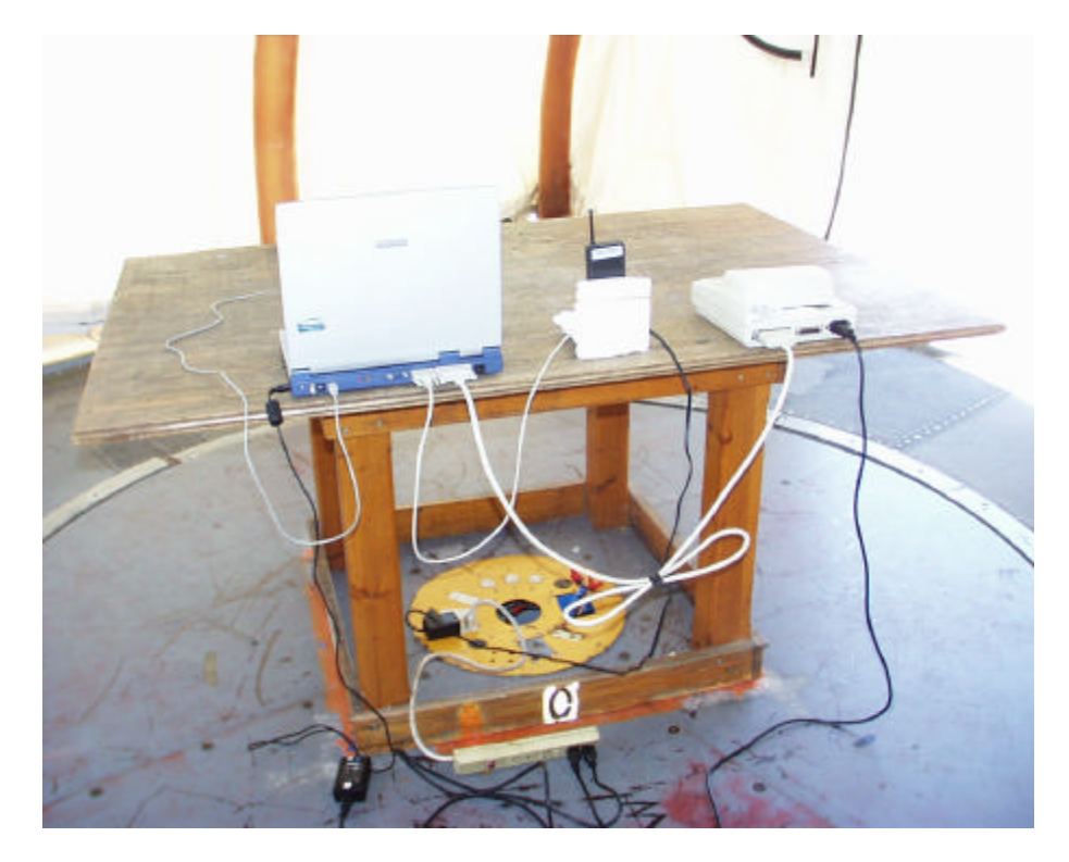
Page 44 of 47