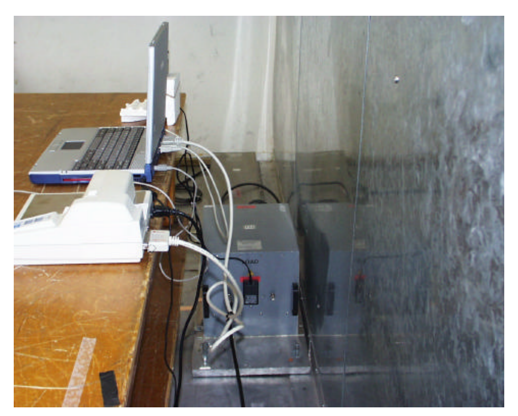
Page 45 of 47