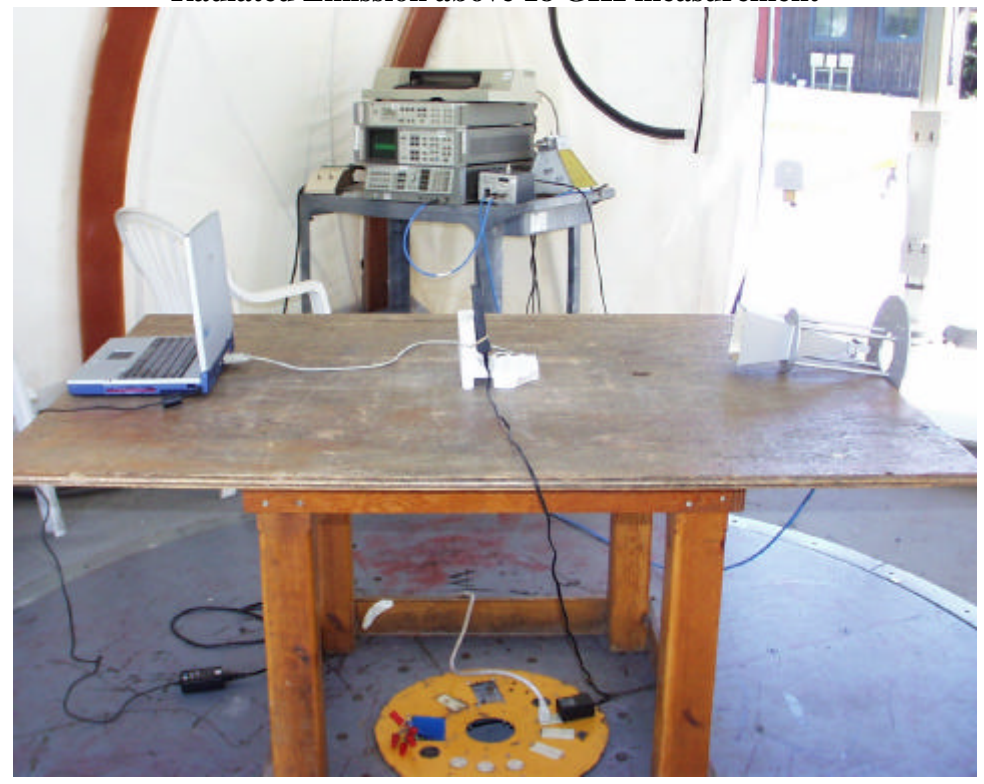
Page 46 of 47