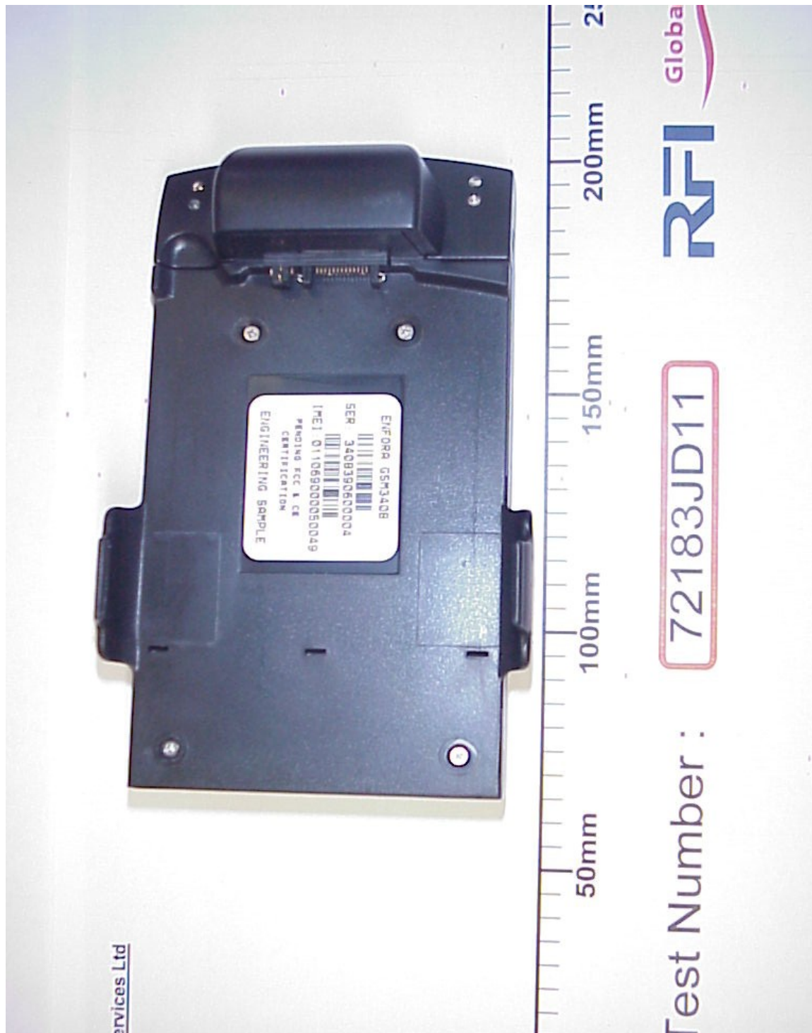
PHT/72183/006: Front View Of EUT

Test Of: Enfora L.P GSM3408 To: OET Bulletin 65 Supplement C: (2001-01)