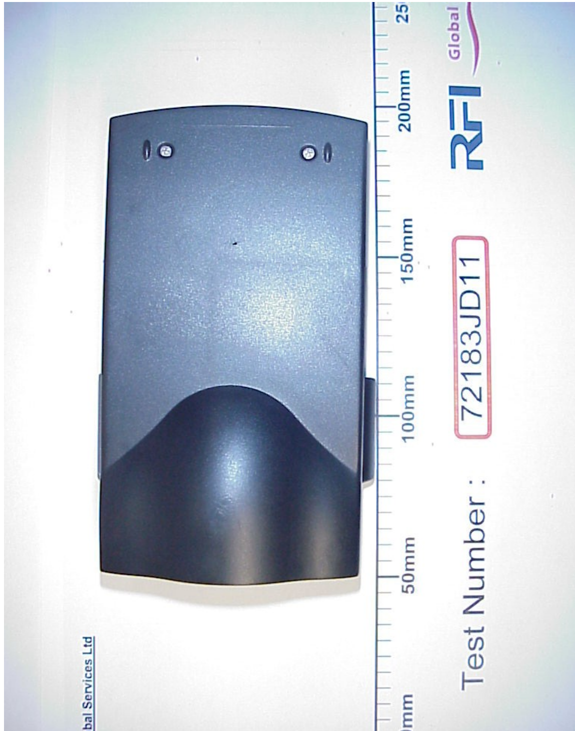
PHT/72183/007: Rear View Of EUT

Test Of: Enfora L.P GSM3408 To: OET Bulletin 65 Supplement C: (2001-01)