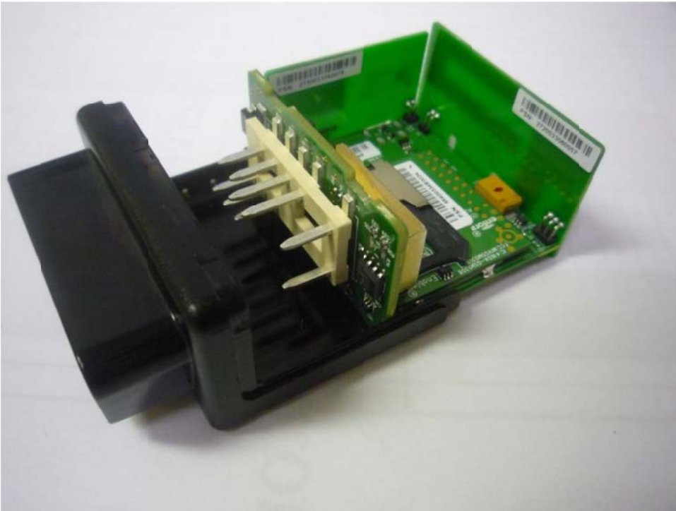
Modem board, top side