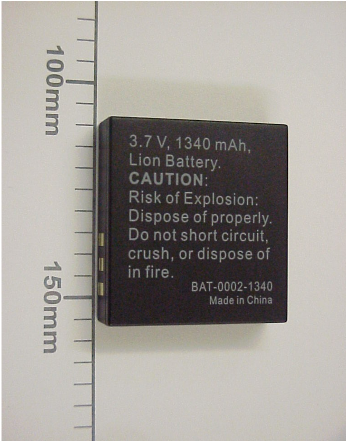
PHT/72182JD11A/006: View of Battery

To: OET Bulletin 65 Supplement C (2001-01)