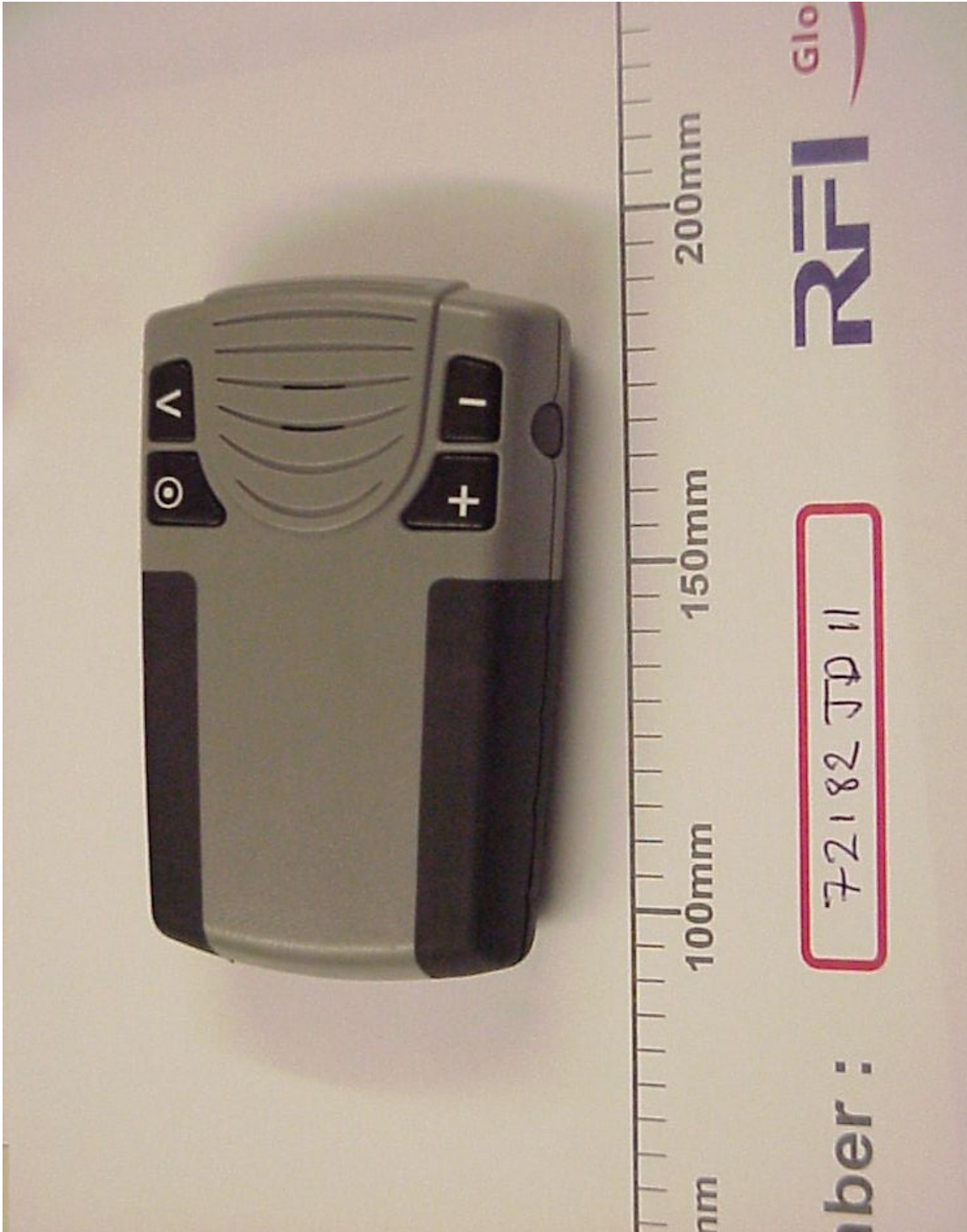
PHT/72182JD11A/002: Front View of EUT

To: OET Bulletin 65 Supplement C (2001-01)