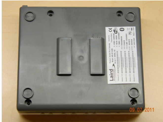
Label example APG BT W400