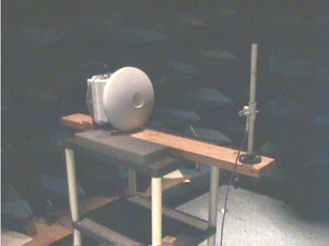
Figure 7.0-3 Radiated Emissions Test Setup