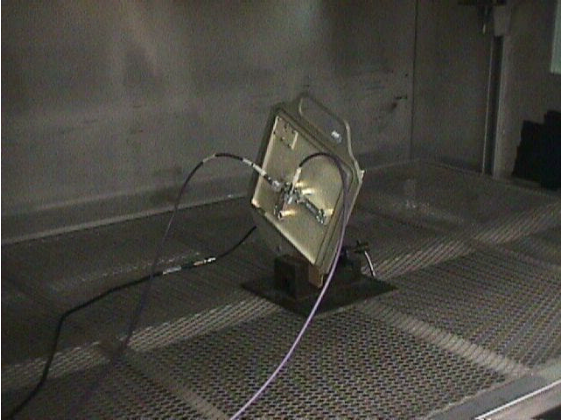
Figure 7.0-4 Zephyr CPE inside of environmental chamber