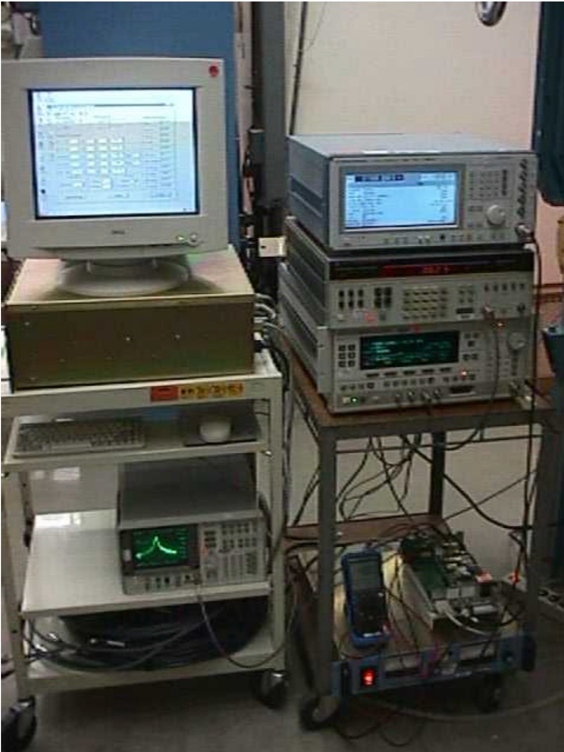
Figure 7.0-5 Support equipment outside of environmental chamber