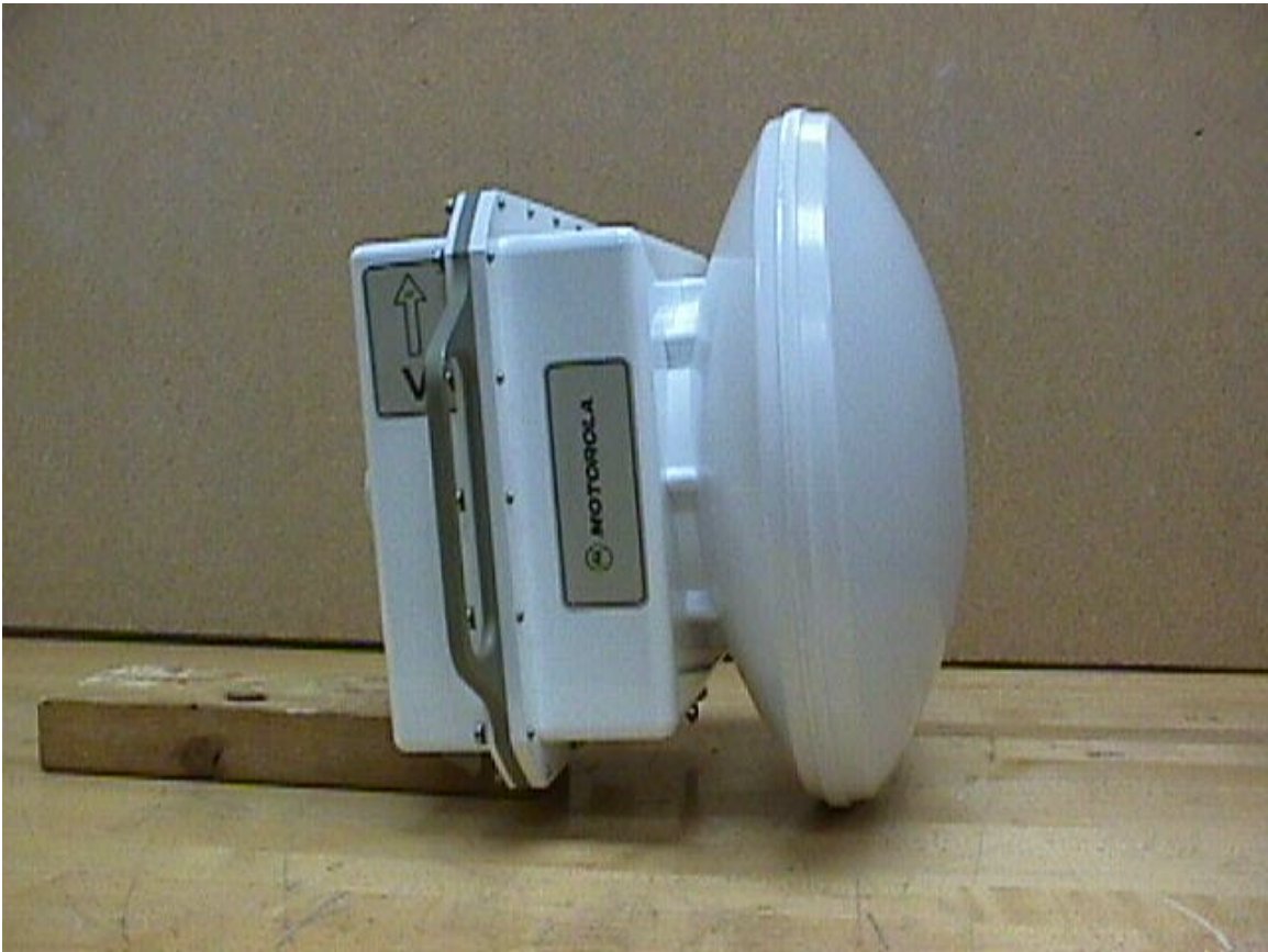
Figure 3.0-2 CPE External View (for vertical polarization)