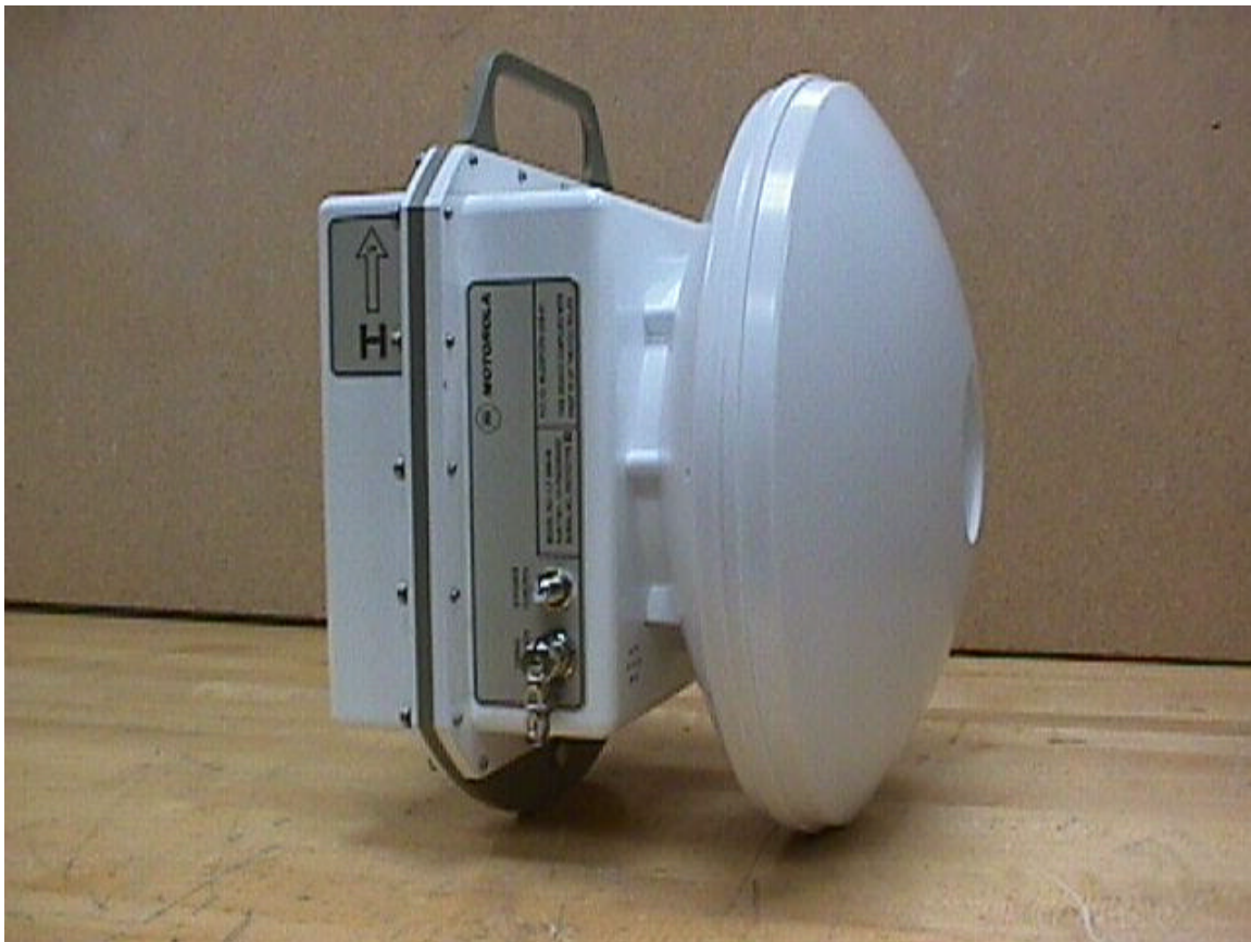
Figure 3.0-1 CPE External View (for horizontal polarization)