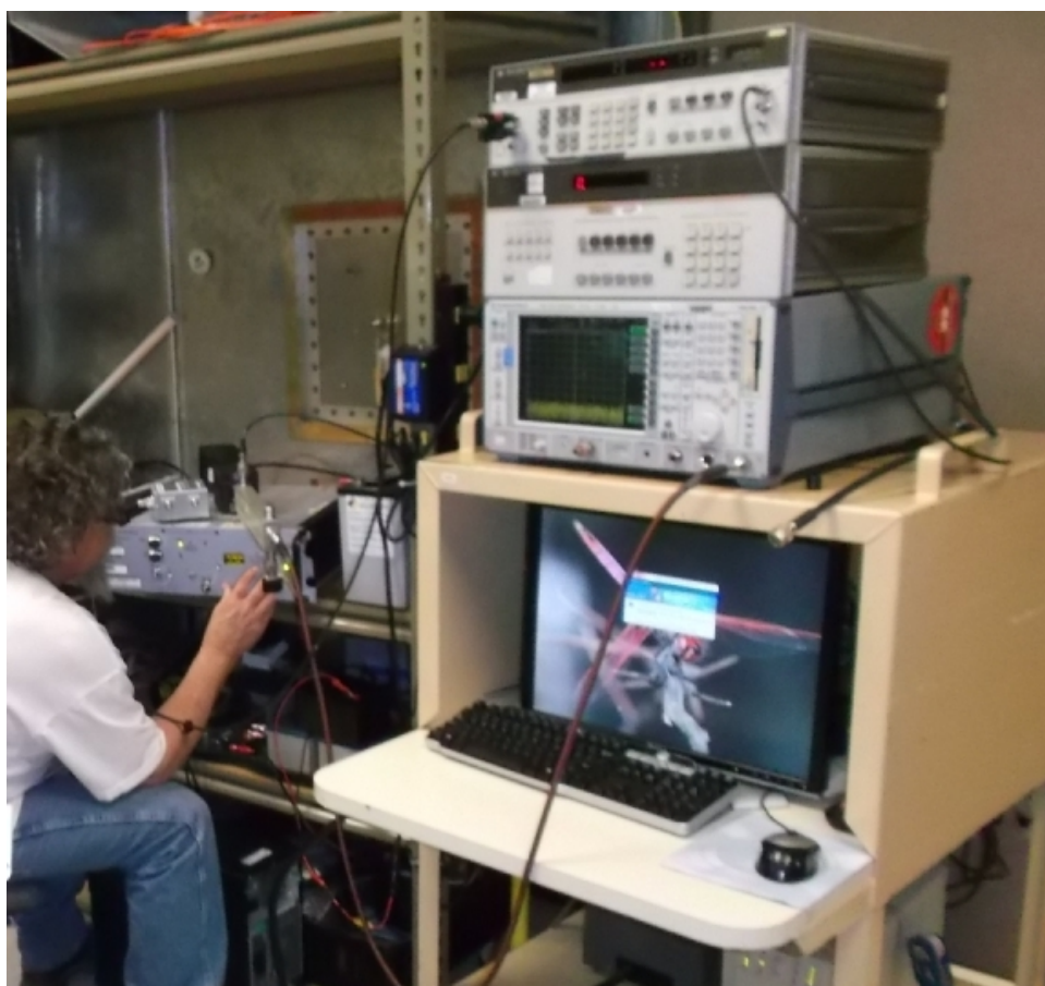
Figure 7.0-6 Front-End Conducted Emissions Test Setup