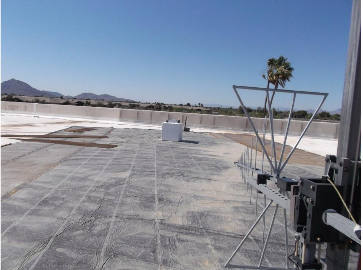
Figure 7.0-4 Radiated Emissions Test Setup (OATS)