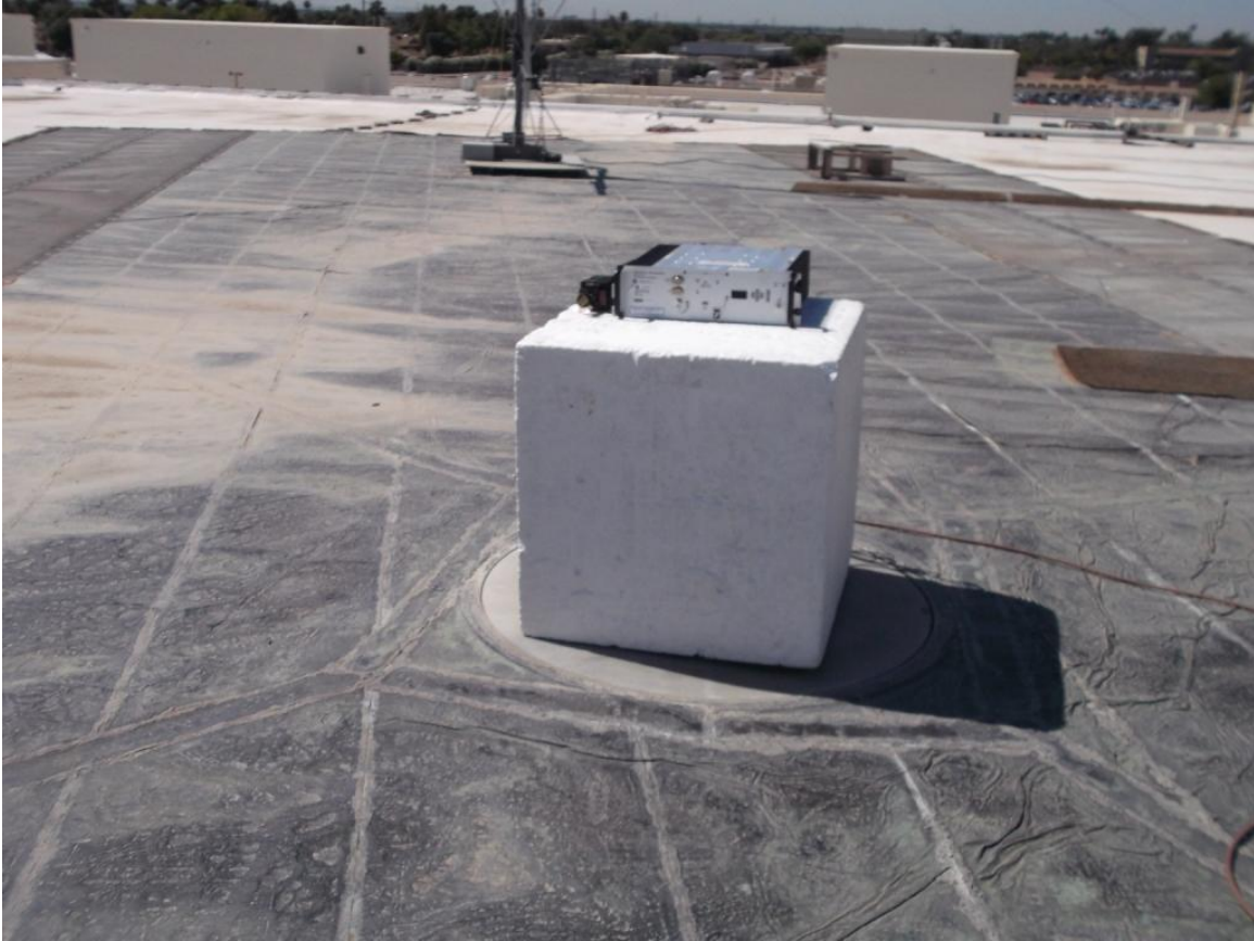
Figure 7.0-5 Radiated Emissions Test Setup (OATS)