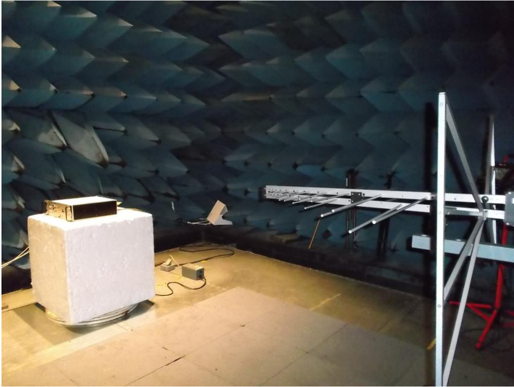
Figure 7.0-2 Radiated Emissions Test Setup (Pre-Scans/Anechoic Chamber)