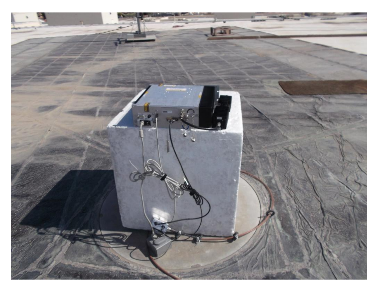
Figure 7.0-4 Radiated Emissions Test Setup (OATS)