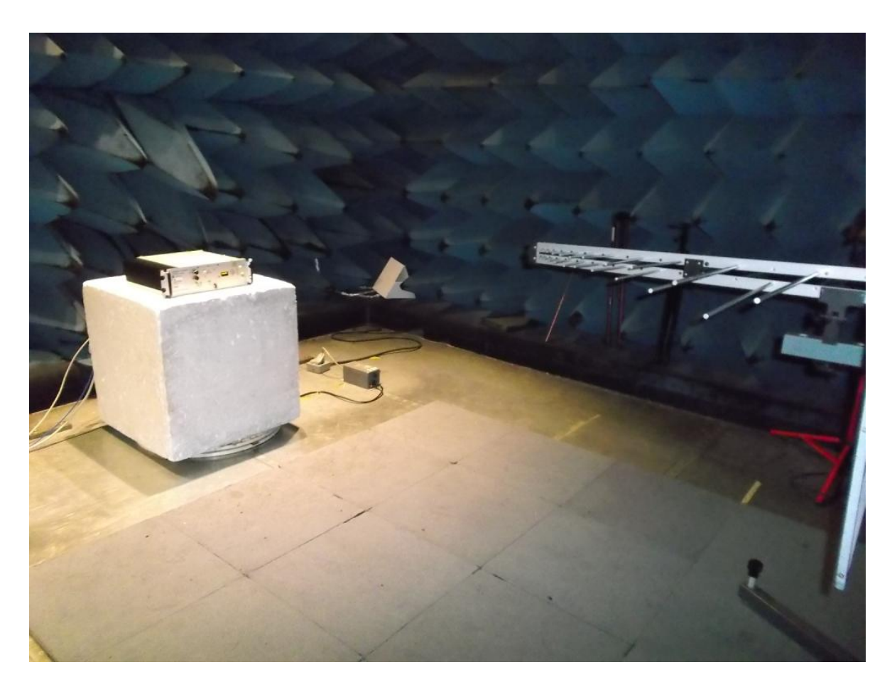
Figure 7.0-2 Radiated Emissions Test Setup (Pre-Scans/Anechoic Chamber)