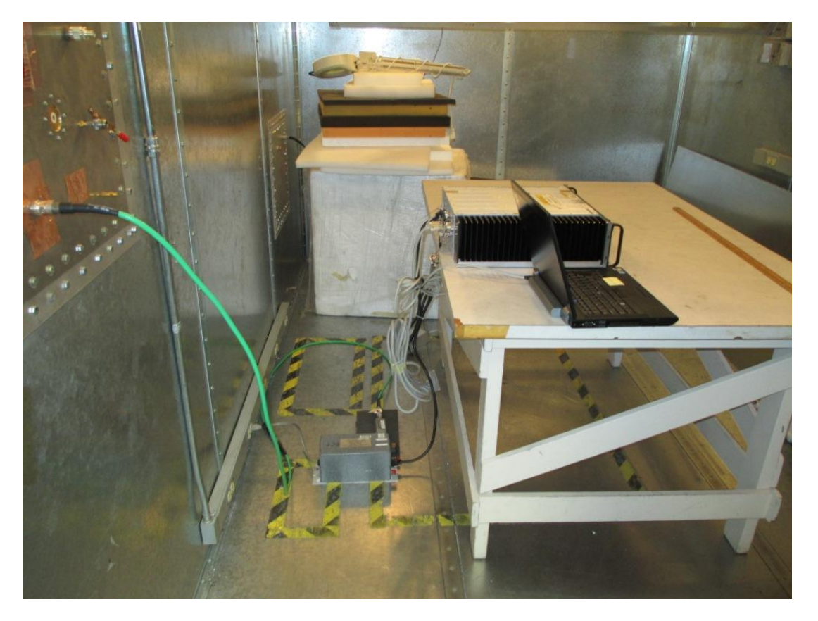
Figure 7.0-1 Conducted Emissions Test Setup