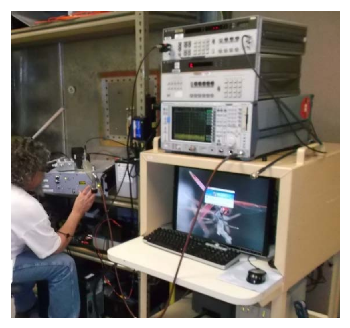
Figure 7.0-6 Front-End Conducted Emissions Test Setup