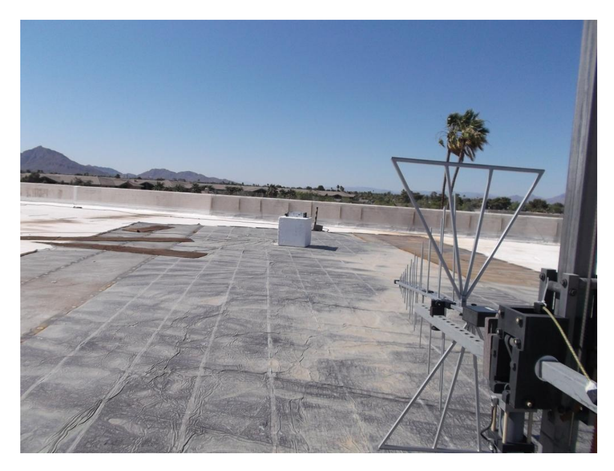
Figure 7.0-5 Radiated Emissions Test Setup (OATS)