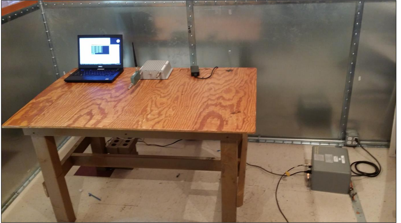
Photograph 3. Conducted Emissions, Test Setup