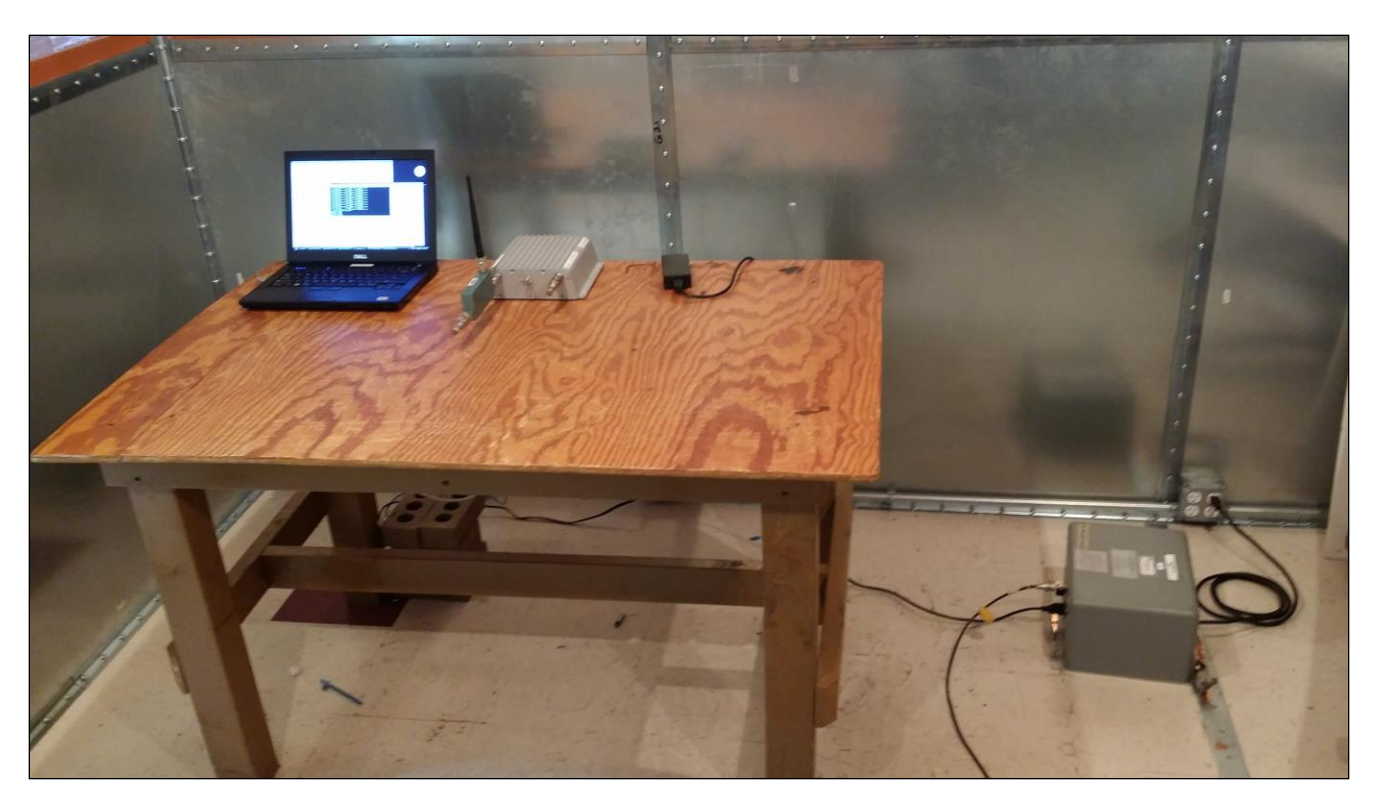
Photograph 3. Conducted Emissions, Test Setup