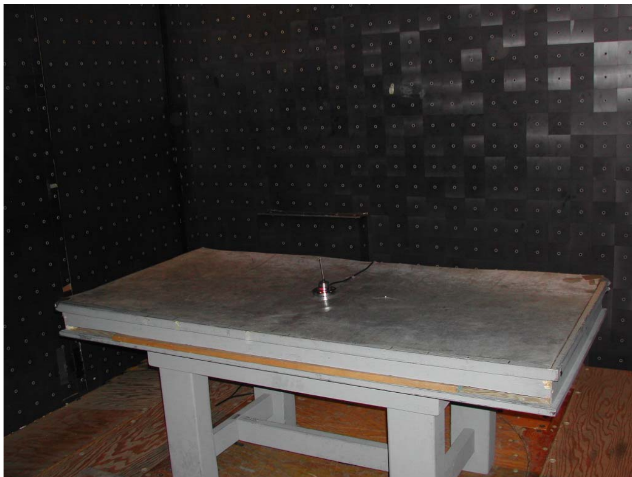
Vehicle Mounted Antenna