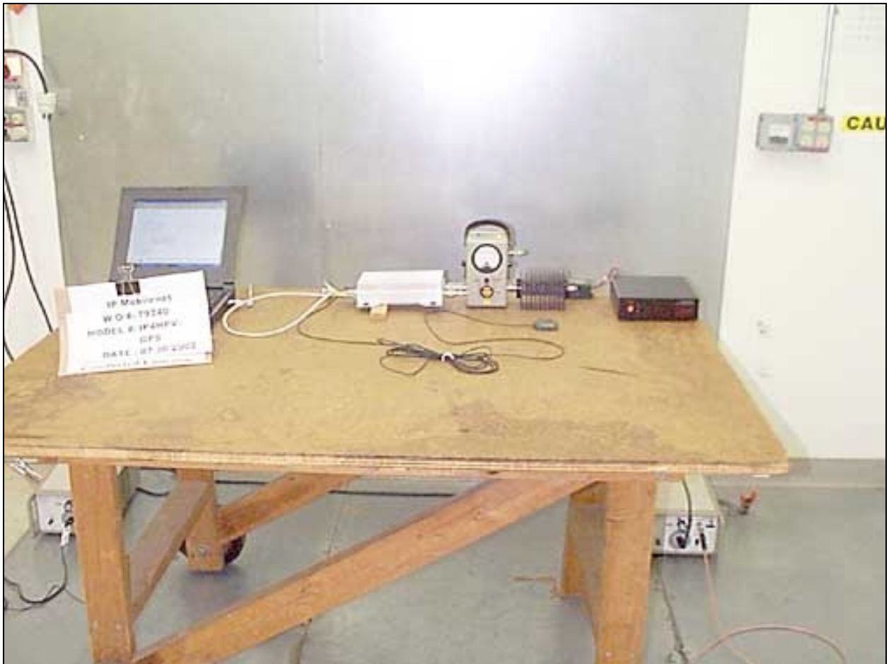
Mains Conducted Emissions - Front View - UTP