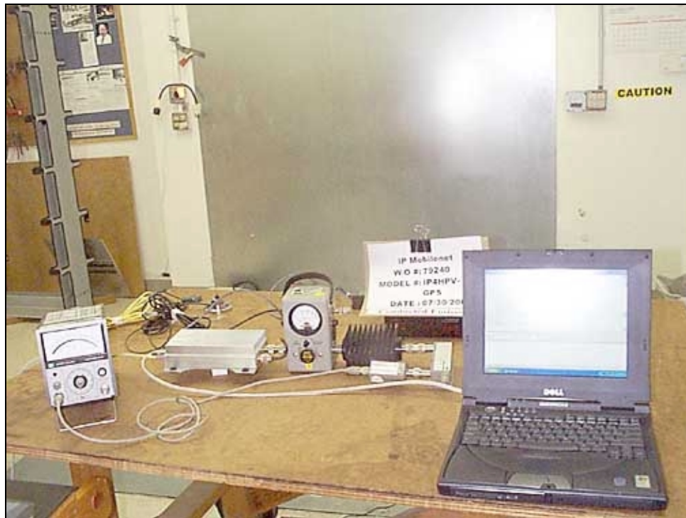
PHOTOGRAPH SHOWING RF POWER FC 90.210(h)