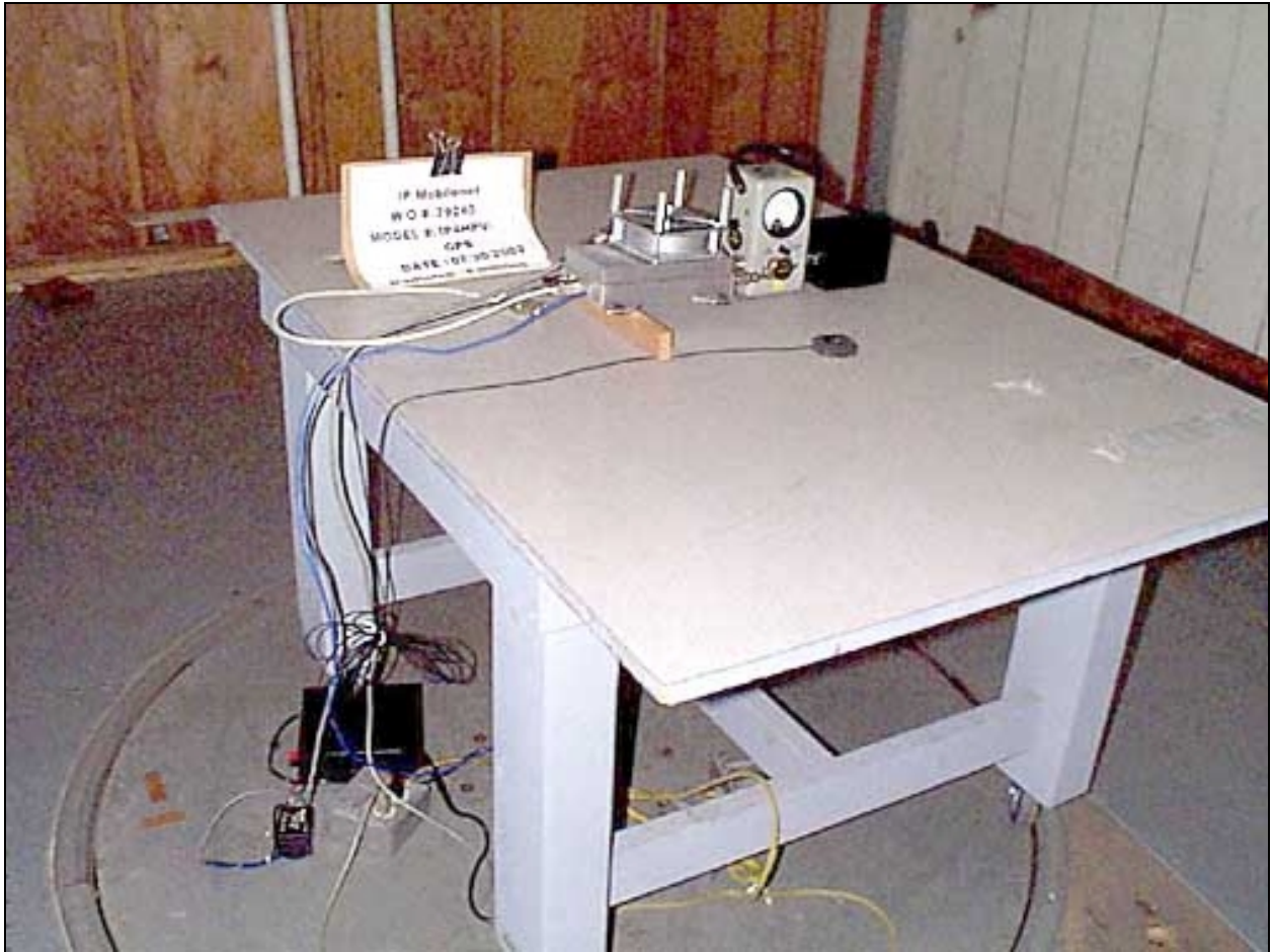
Radiated Emissions - Front View - UTP