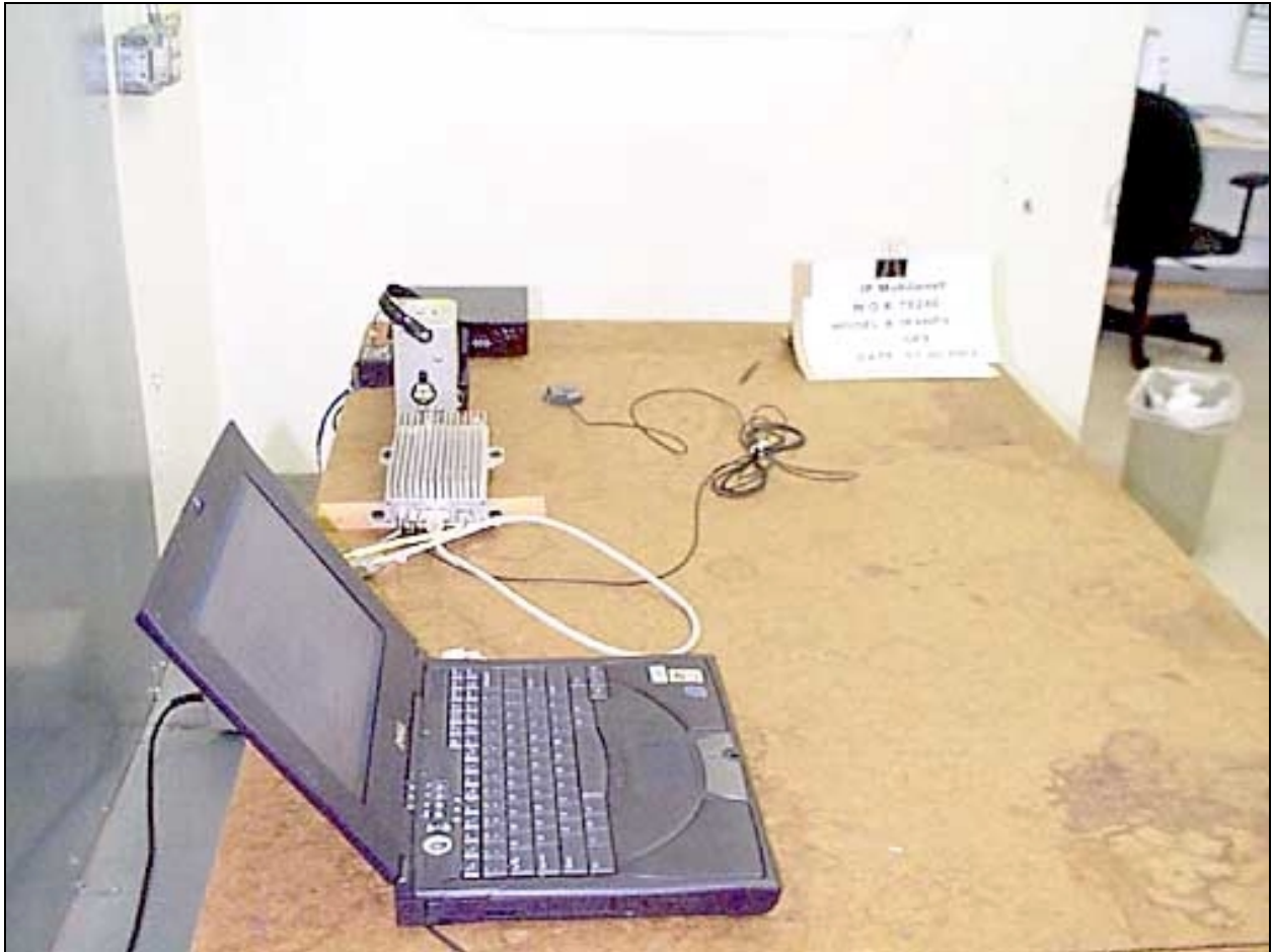
Mains Conducted Emissions - Back View – UTP