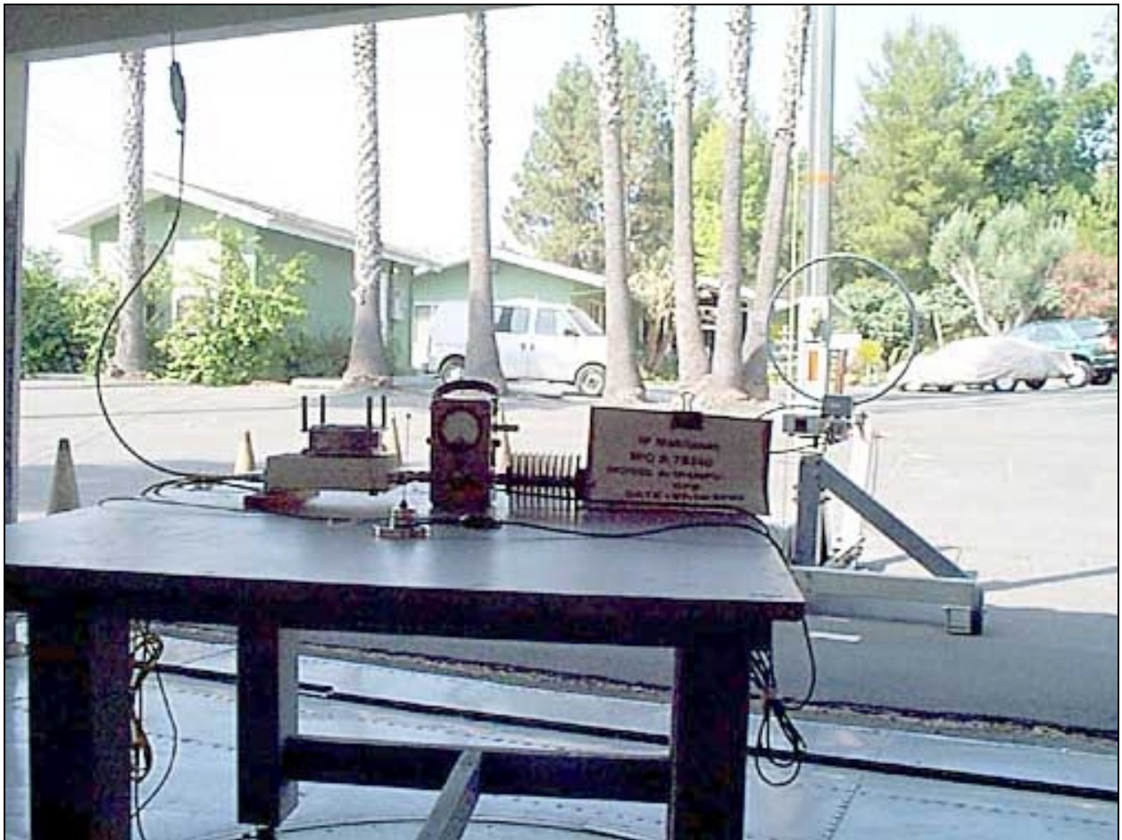
Radiated Emissions - Loop Antenna