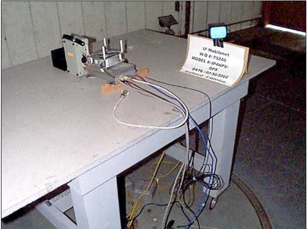
Radiated Emissions - Back View - UTP