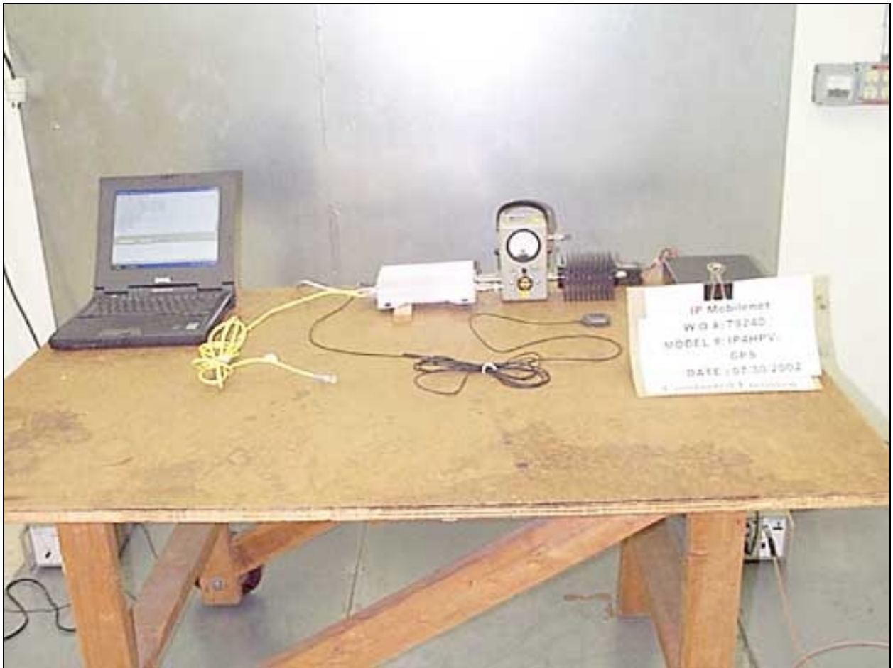
Mains Conducted Emissions - Front View - RS232