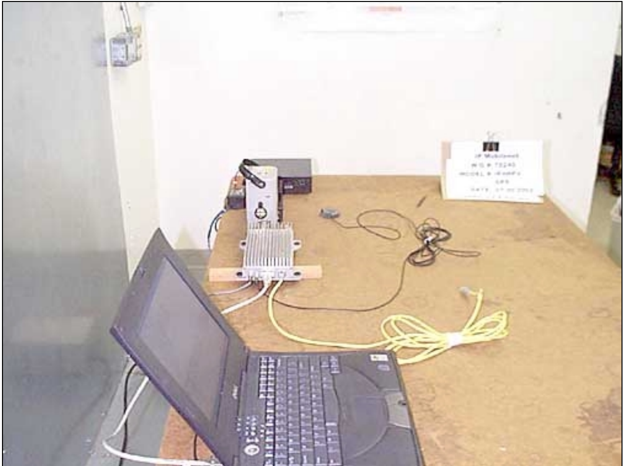
Mains Conducted Emissions - Back View - RS232