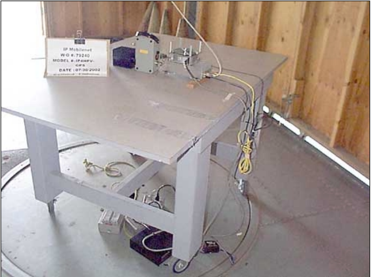
Radiated Emissions - Back View - RS232