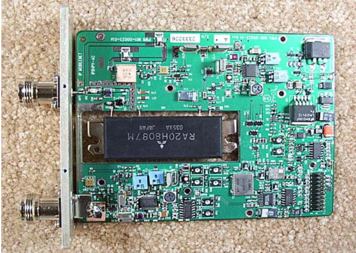
Back PCB Component Side