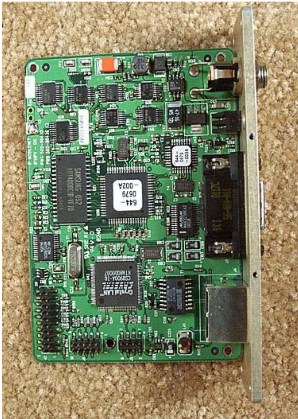
Front PCB Component Side