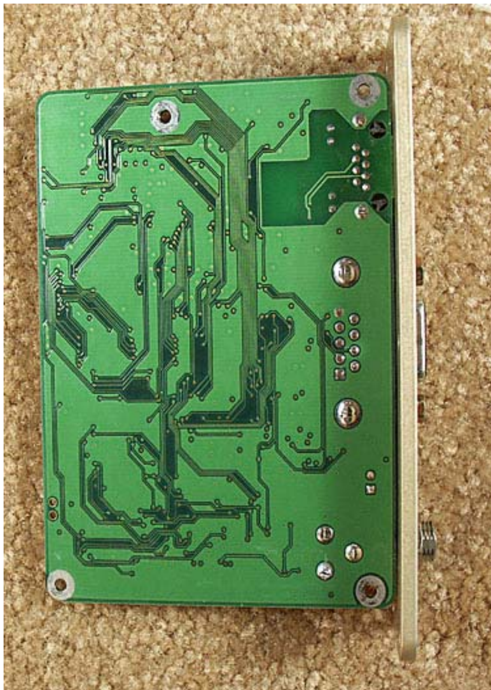
Front PCB Back Side