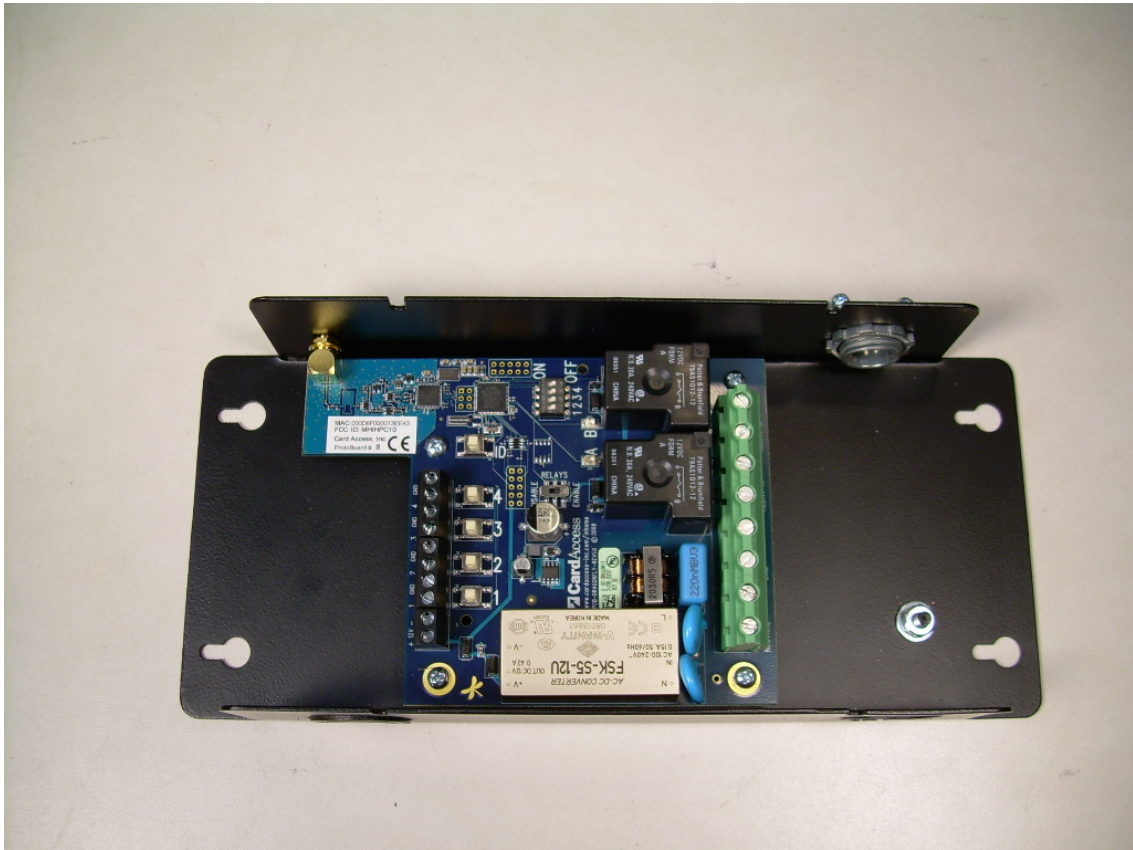
Internal View Front of the EUT