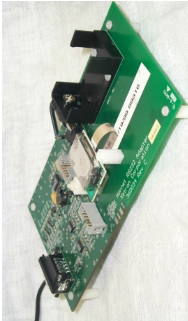
Photo 1. EUT and Interface Board Used for Testing