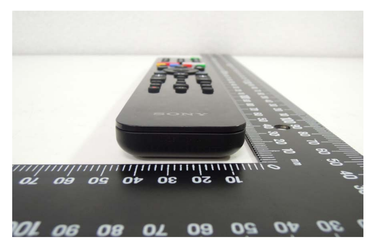
Side View of EUT - 2