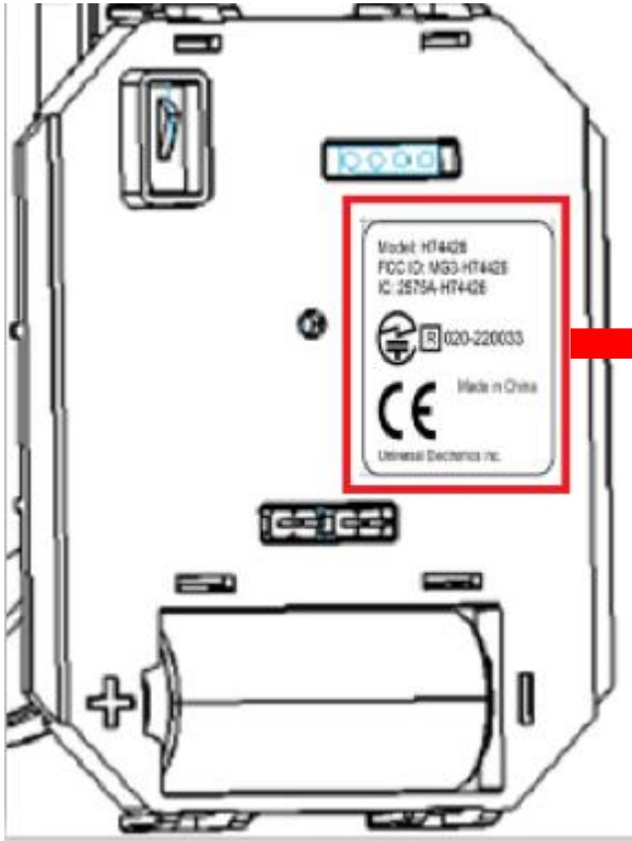
Rear side of the device