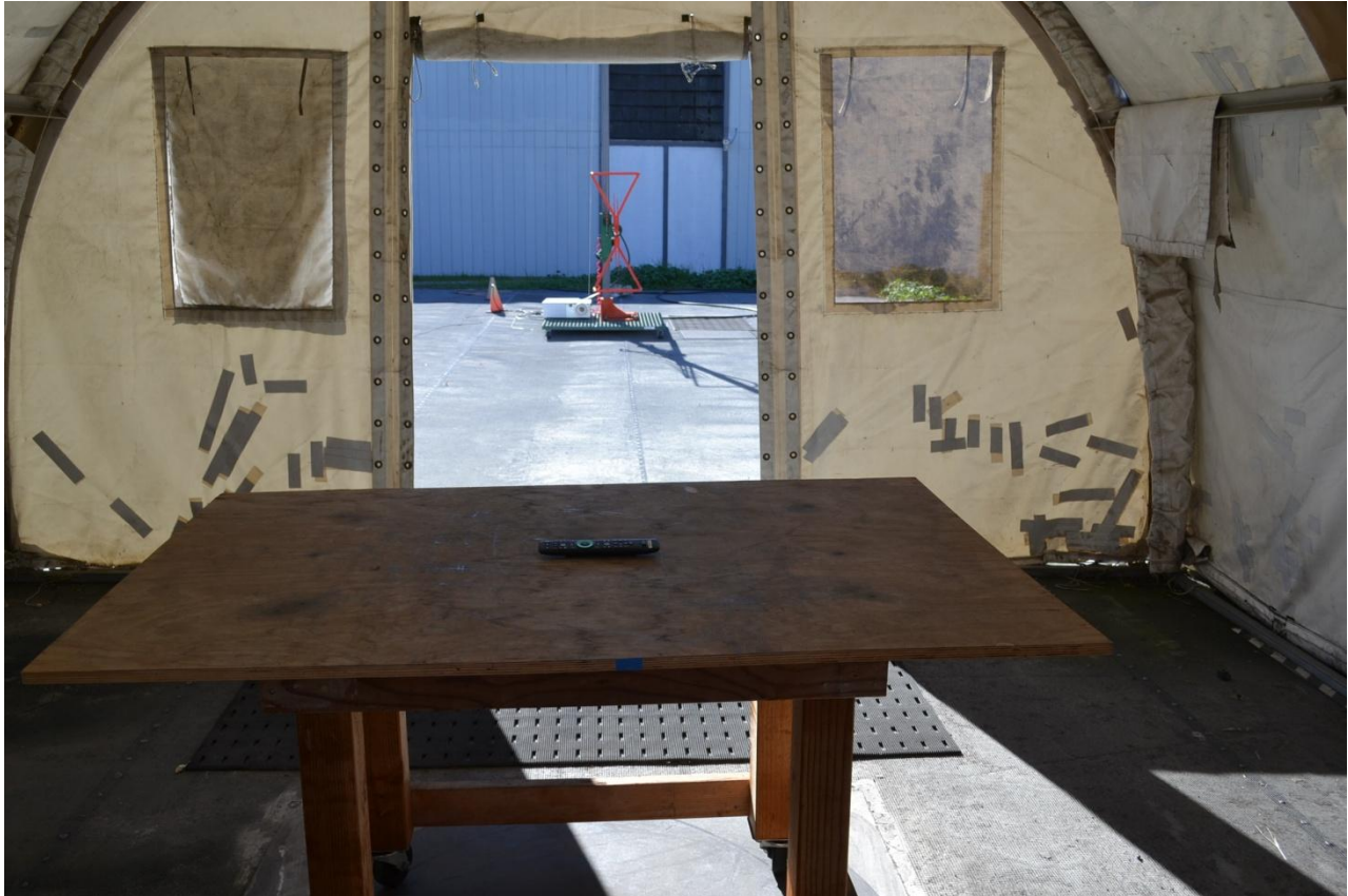
Radiated Emissions - 10 Meter Setup (30 – 1000 MHz)