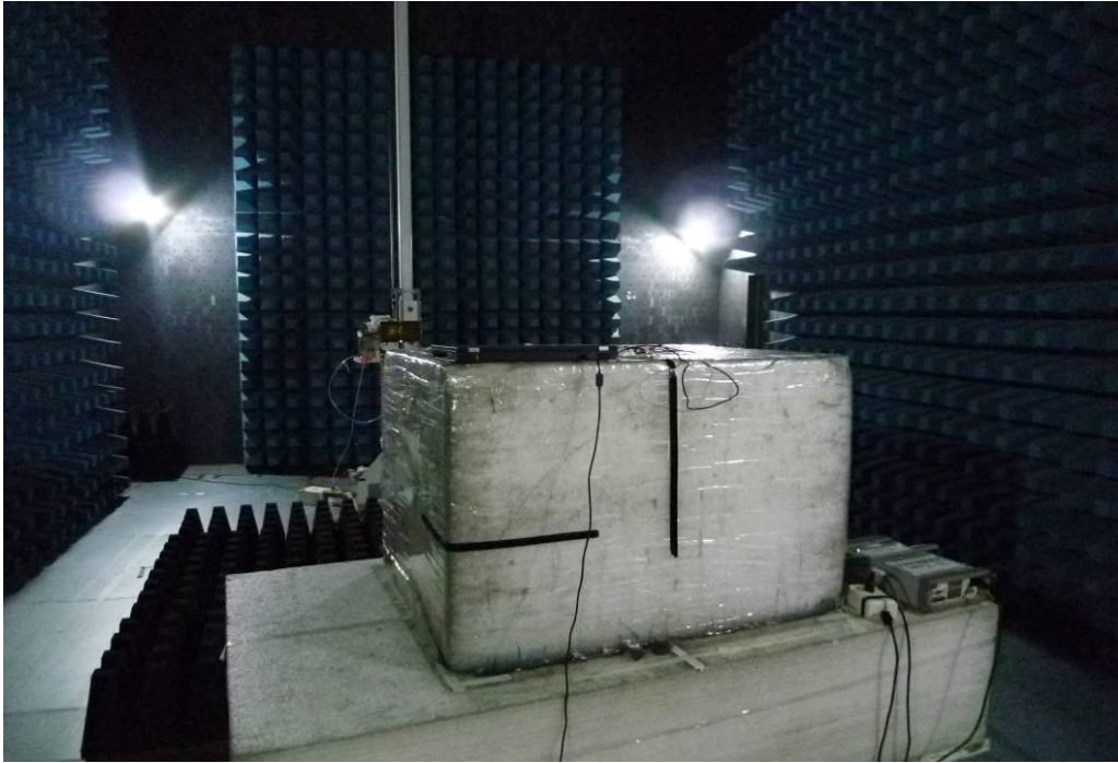
Radiated Emission Set up Photos (Front View)