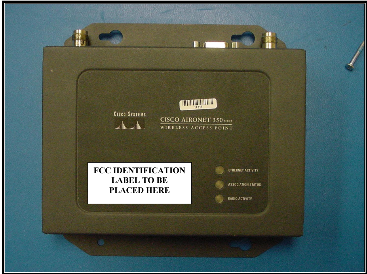
PHOTOGRAPH 2: SECOND FCC ID LABEL LOCATION

FCC ID: MFMSAMP24W This device complies with Part 15 of the FCC Rules. Operation is subject to the following two conditions: (1) This device may not cause harmful interference, and (2) this device must accept any interference received, including interference that may cause undesired operation.