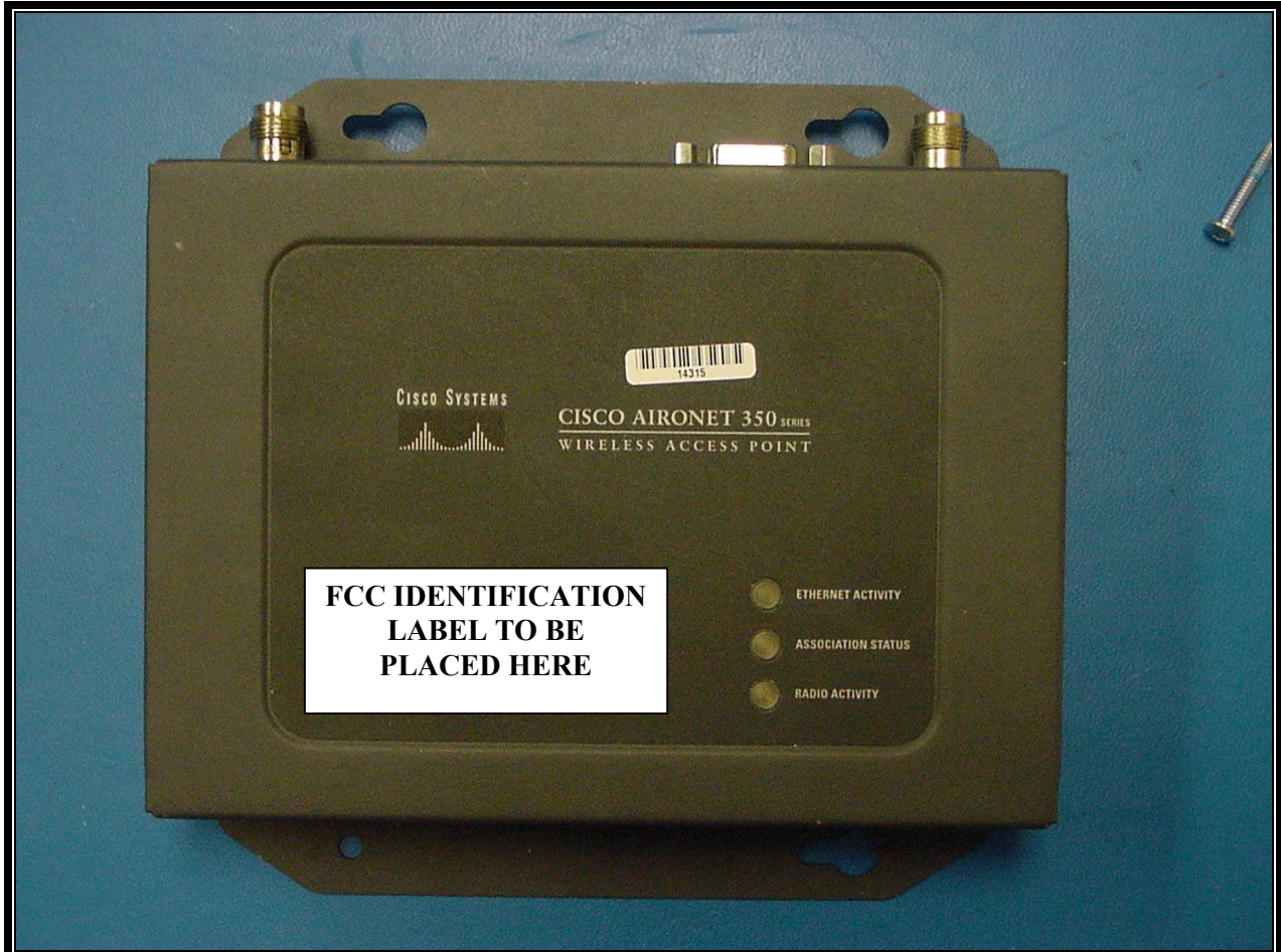
PHOTOGRAPH 2: SECOND FCC ID LABEL LOCATION

FCC ID: MFMSAMP24S This device complies with Part 15 of the FCC Rules. Operation is subject to the following two conditions: (1) This device may not cause harmful interference, and (2) this device must accept any interference received, including interference that may cause undesired operation.