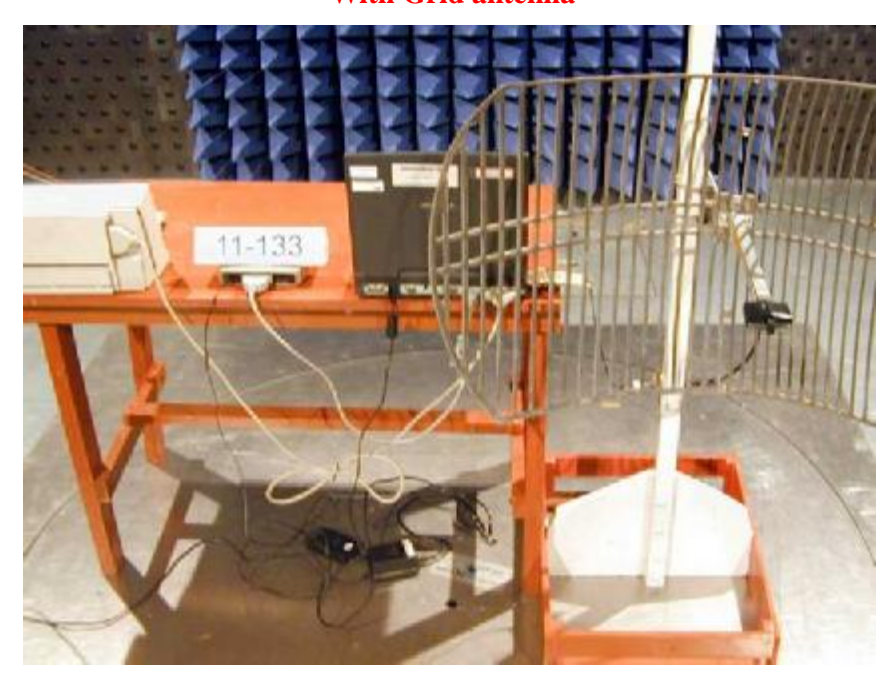
With Grid antenna