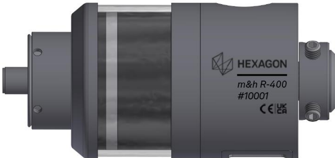
Fig 1 CE & UKCA