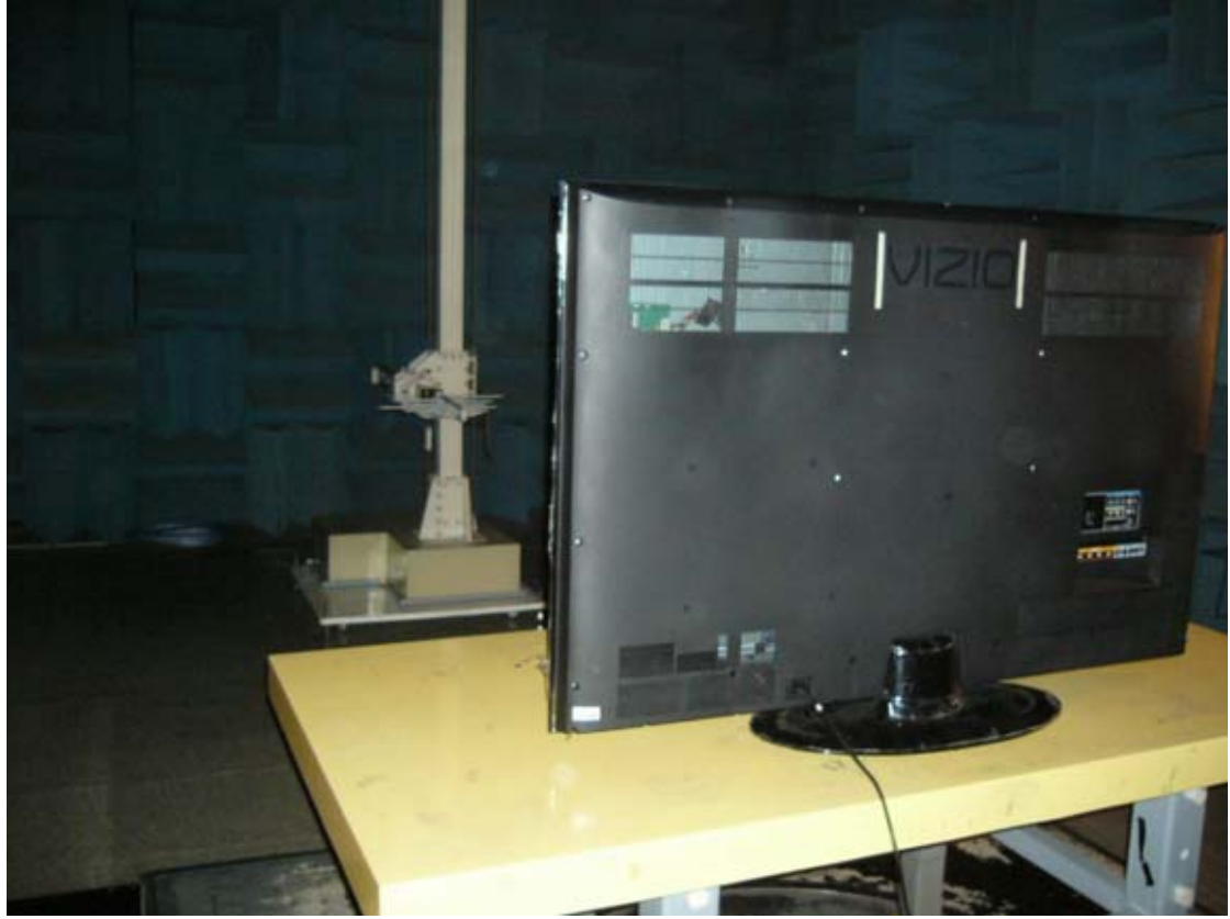
BACK VIEW OF RADIATED MEASUREMENT