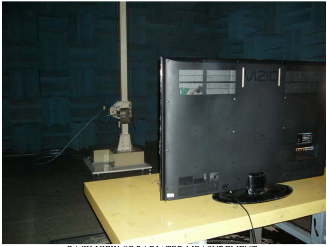
BACK VIEW OF RADIATED MEASUREMENT