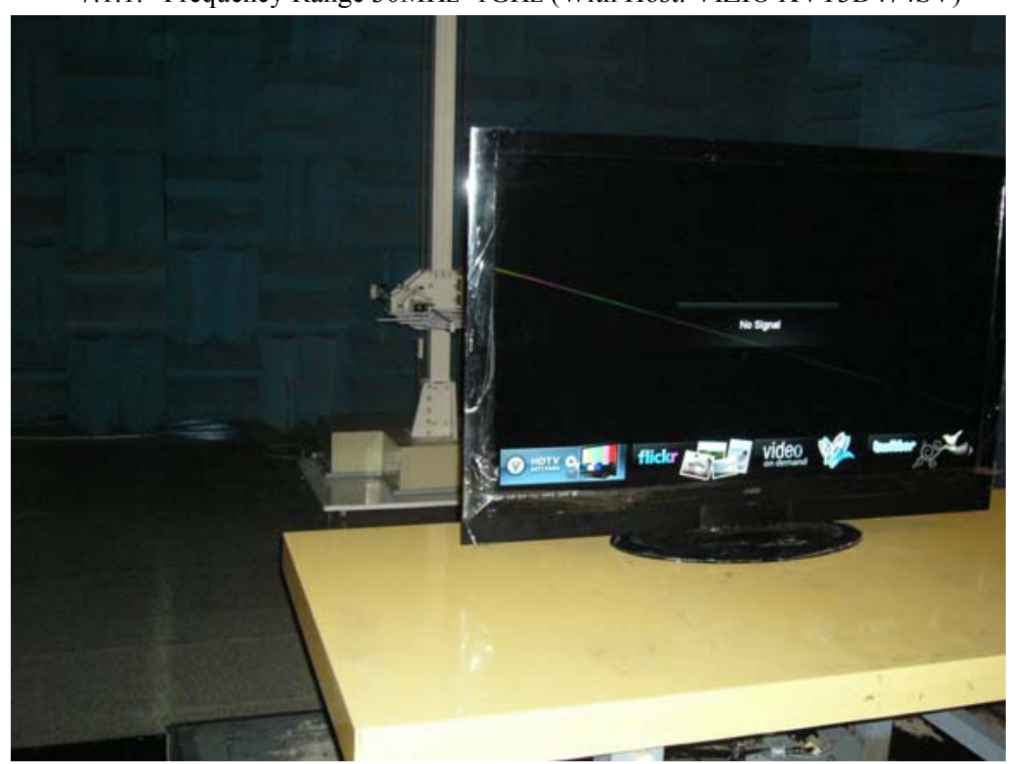
FRONT VIEW OF RADIATED MEASUREMENT

7.1. Photos of Radiated Measurement at Semi-Anechoic Chamber 7.1.1. Frequency Range 30MHz~1GHz (With Host: VIZIO XVT3D474SV)