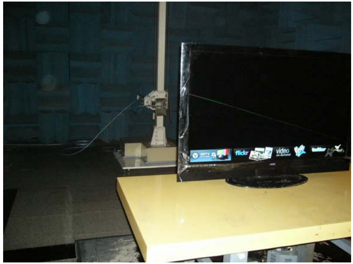
FRONT VIEW OF RADIATED MEASUREMENT