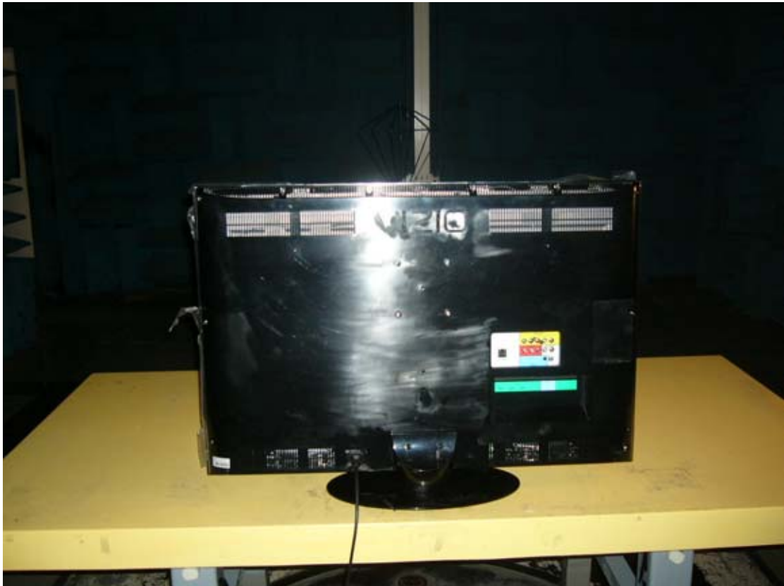
BACK VIEW OF RADIATED MEASUREMENT