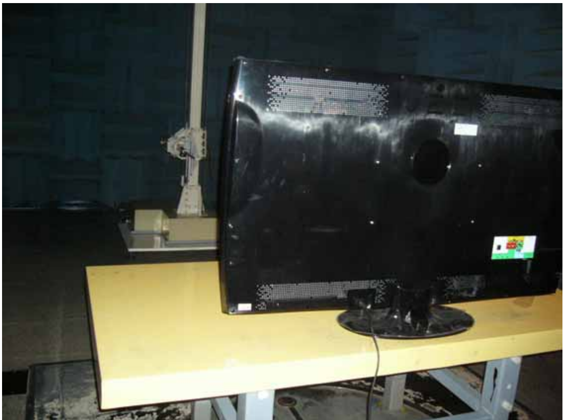
BACK VIEW OF RADIATED MEASUREMENT