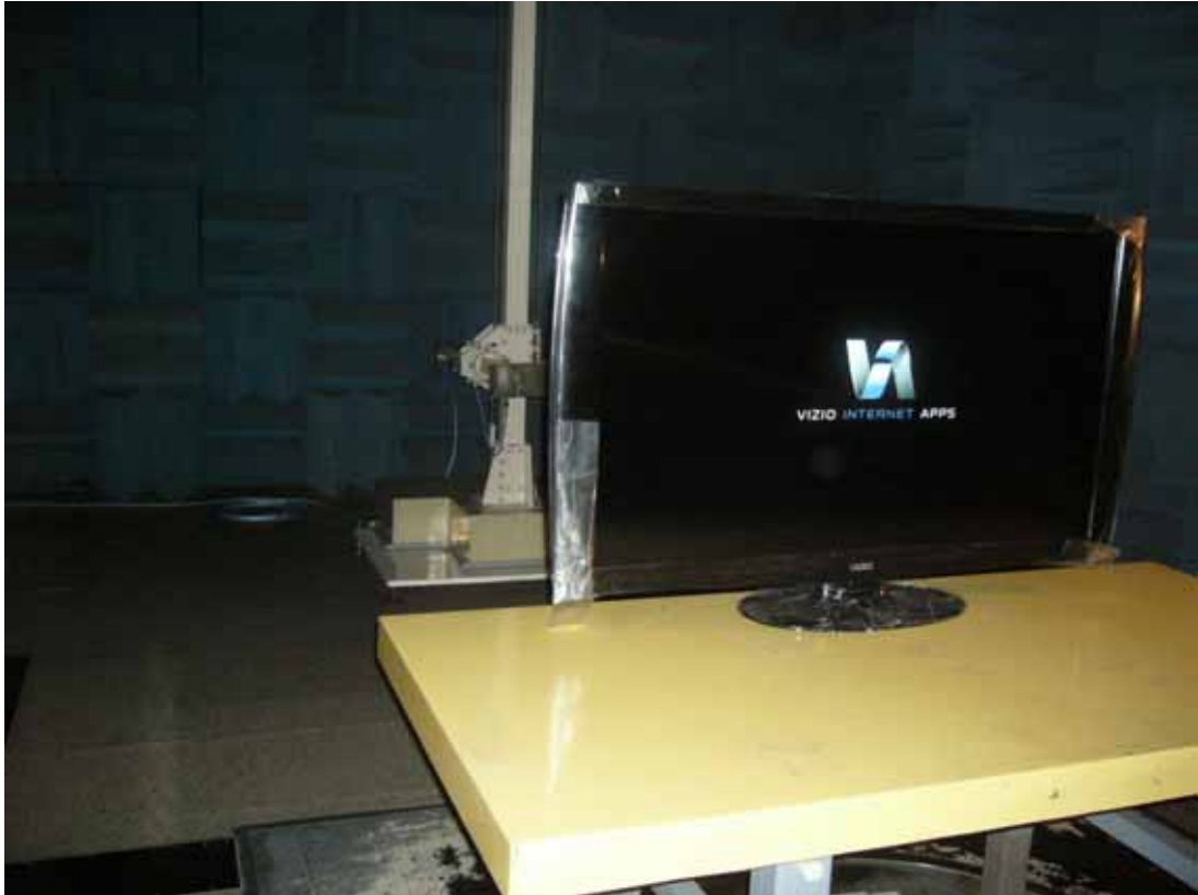
FRONT VIEW OF RADIATED MEASUREMENT