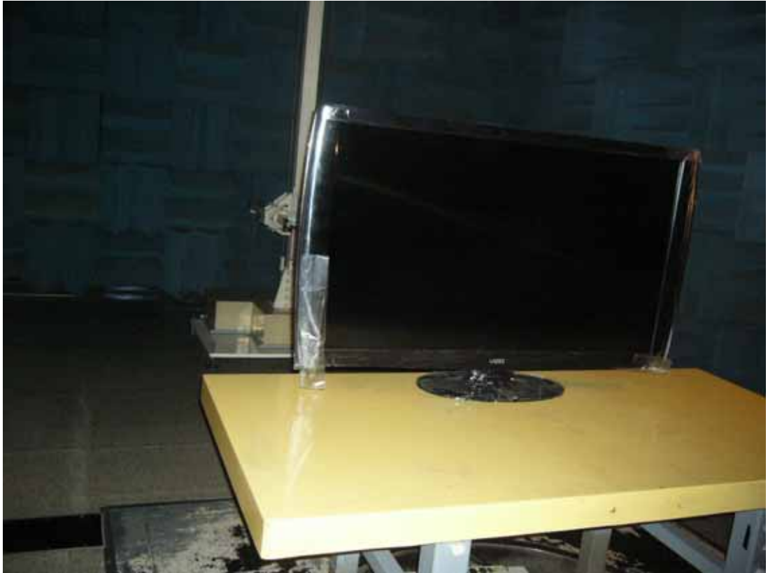
FRONT VIEW OF RADIATED MEASUREMENT