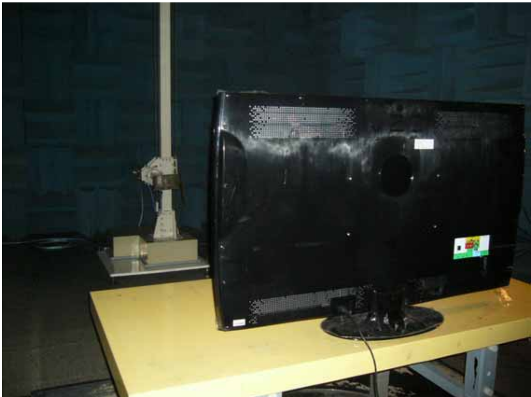
BACK VIEW OF RADIATED MEASUREMENT