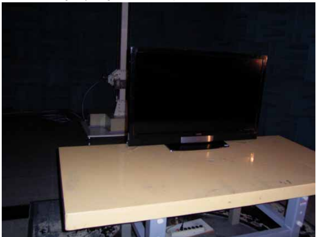
FRONT VIEW OF RADIATED MEASUREMENT