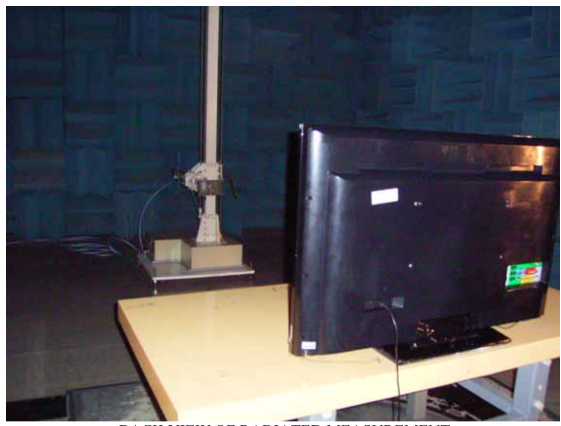
BACK VIEW OF RADIATED MEASUREMENT