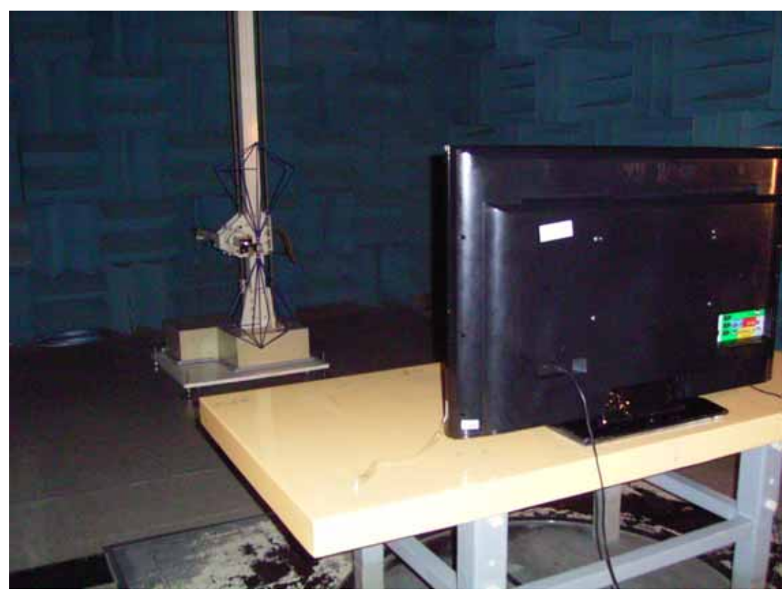
BACK VIEW OF RADIATED MEASUREMENT