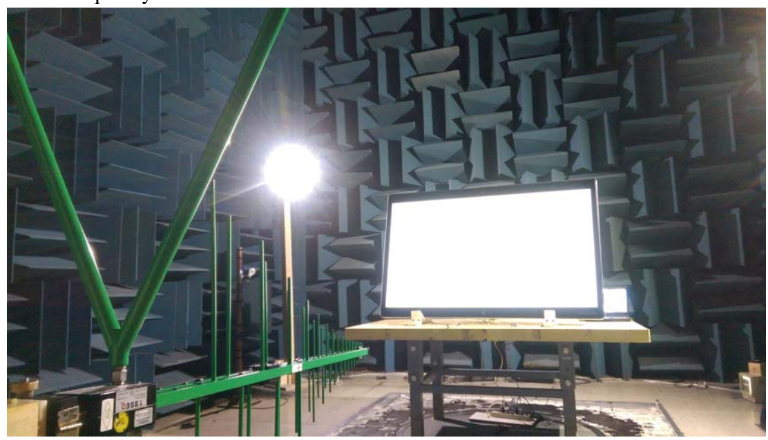
Frequency Above 1GHz