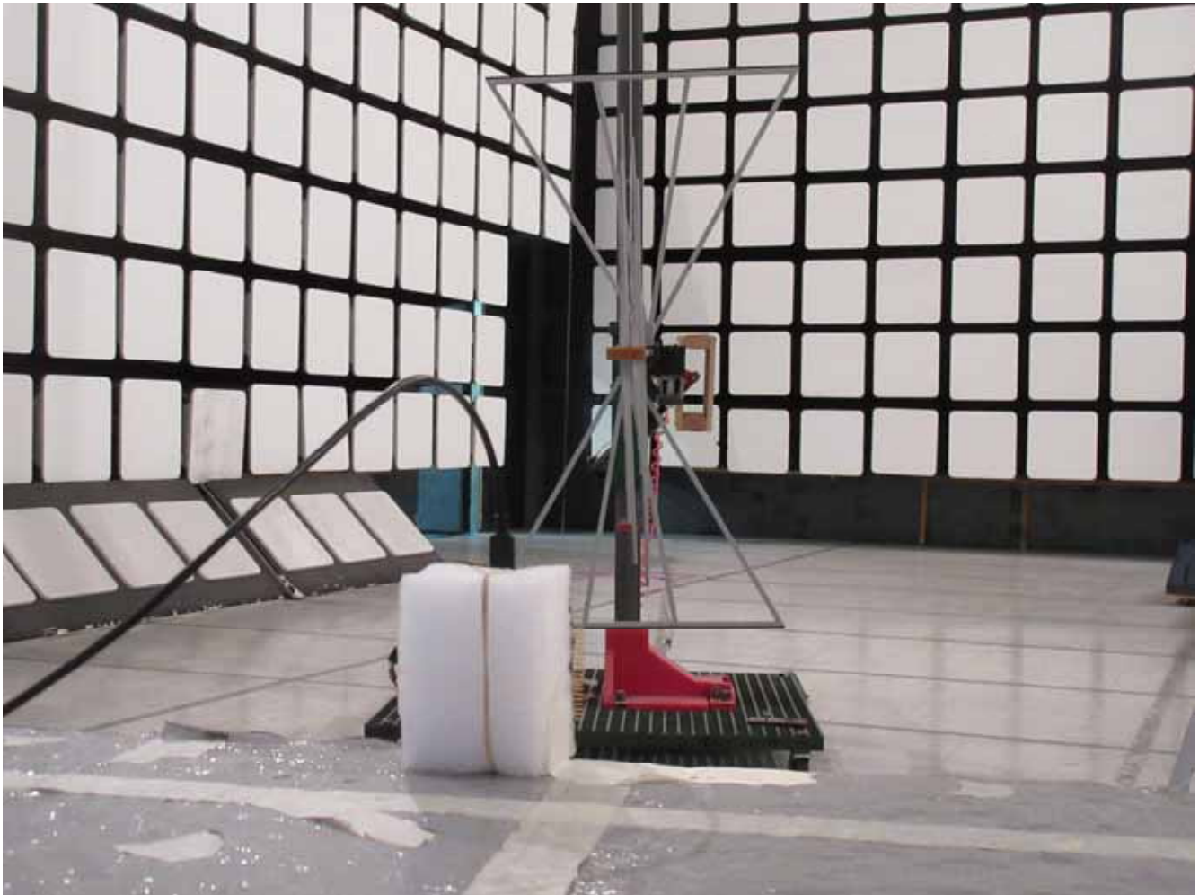
Radiated Emissions @ 3 m Orthogonal Position 2