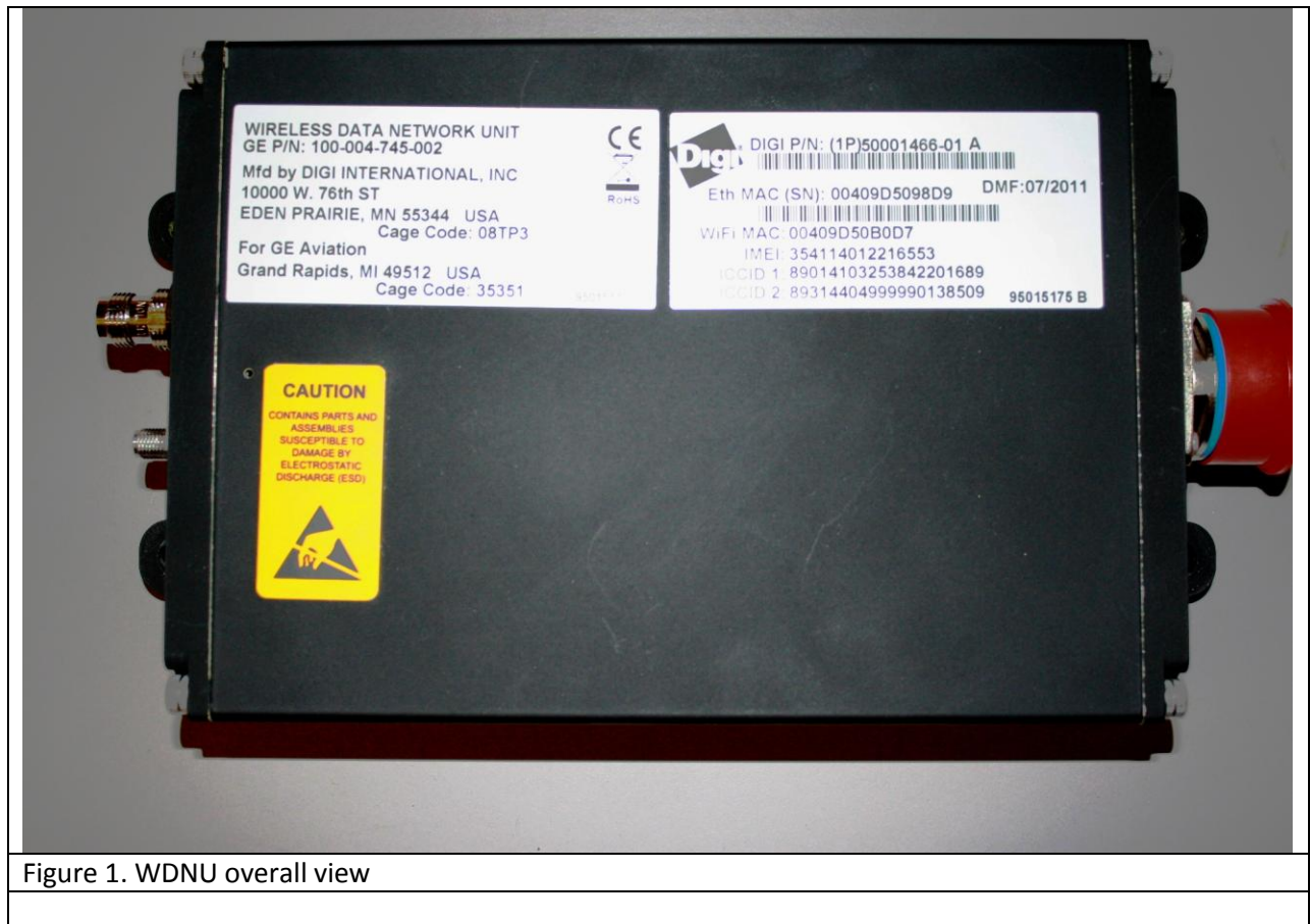
Figure 1. WDNU overall view

Digi International Inc Model name: WDNU FCC ID: MCQ-WDNU IC: 1846A-WDNU