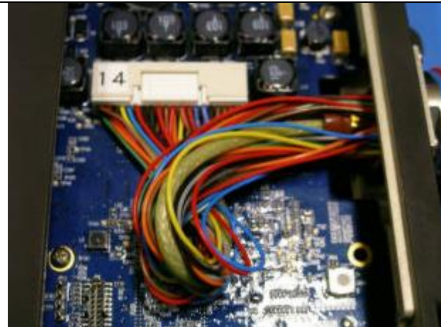
Figure 4. Main connector to board interconnect.