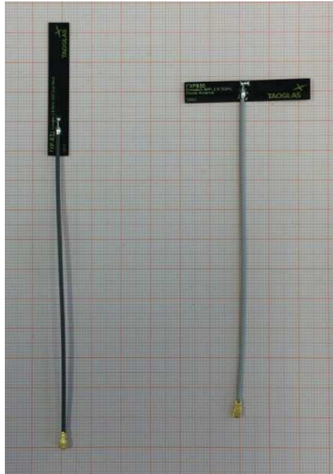
Photo 5: TAOGLAS FXP831.07.0100C (left) / TAOGLAS FXP830.07.0100C (right)