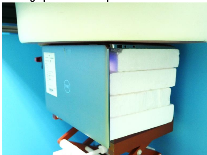
Bottom of EUT with 0 mm Gap