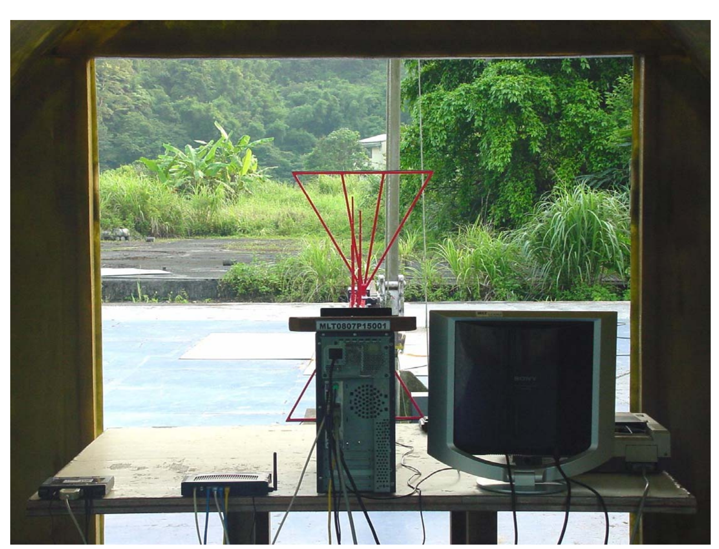
Rear View of The Test Configuration