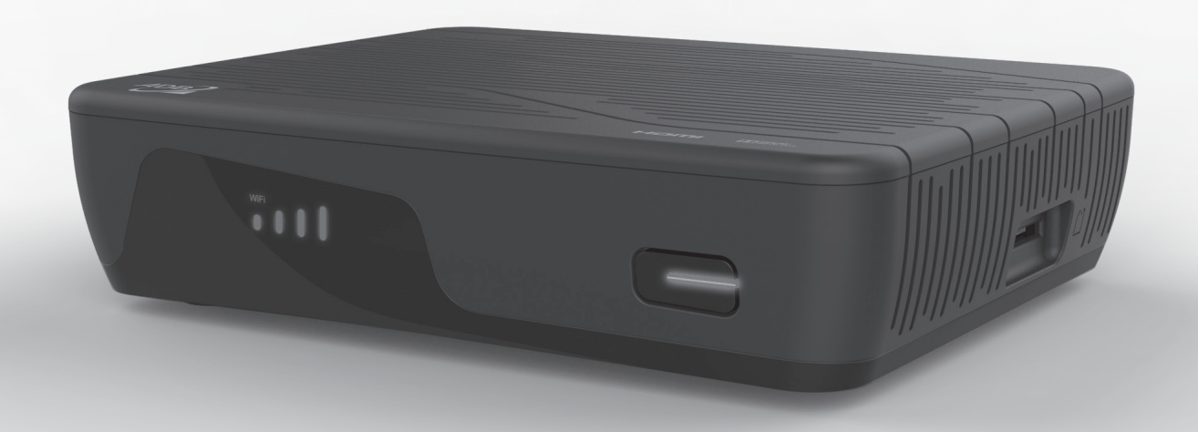
Quick Installation Manual ADB - 1761WF