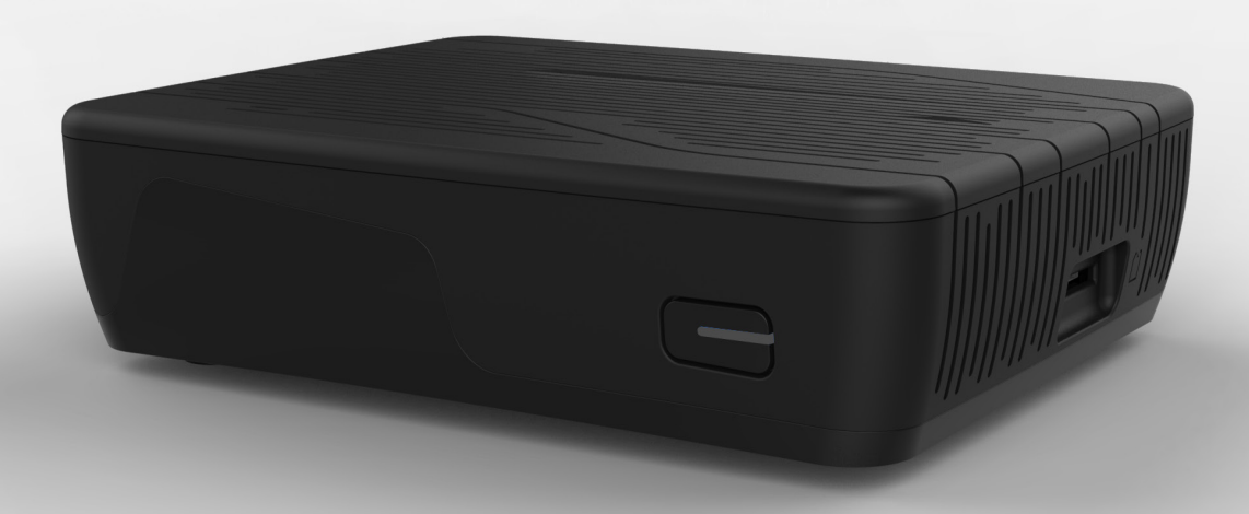
Quick Installation Manual ADB - 1761W