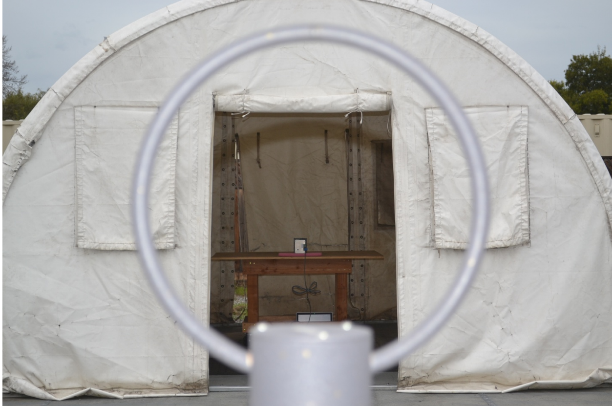
Radiated Emissions 9 kHz – 30 MHz