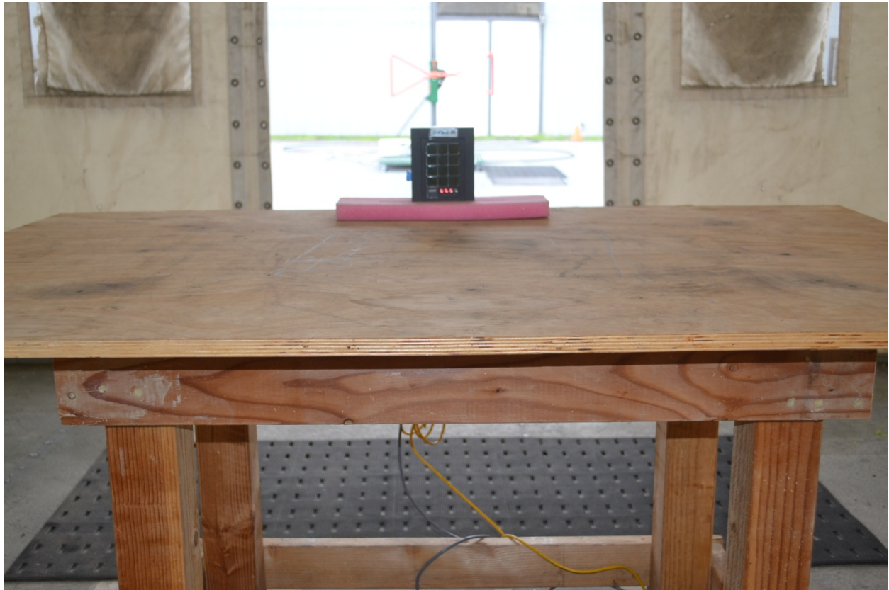
Radiated Emissions 30 MHz – 1 GHz