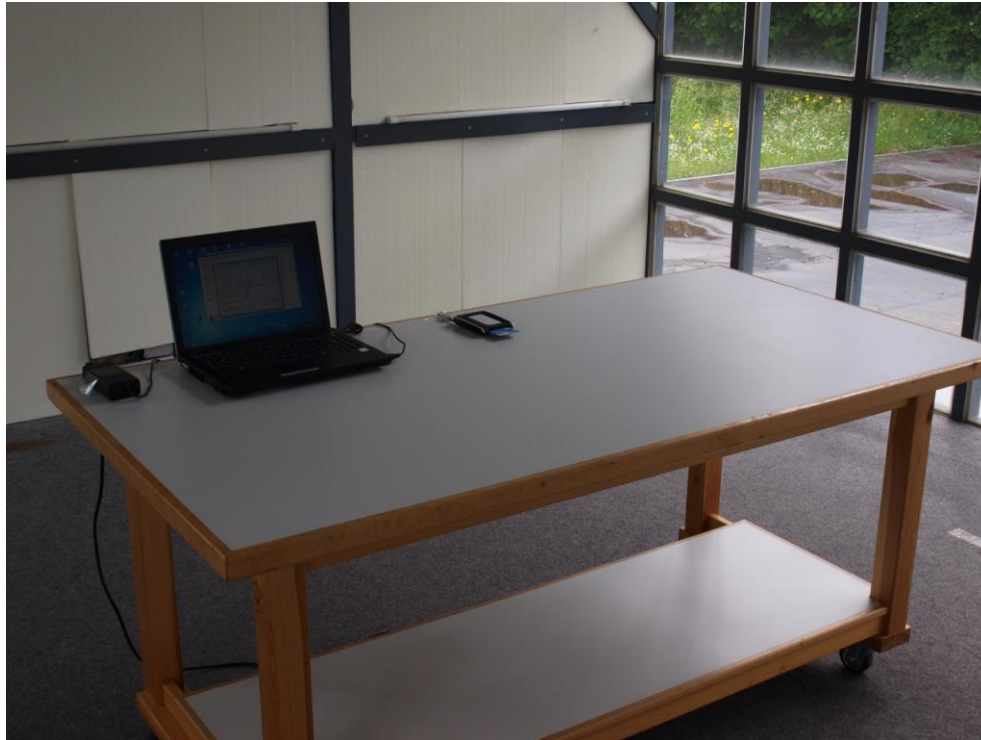
Picture 1: EUT test setup open site for spectrum mask and radiated emission test (front)