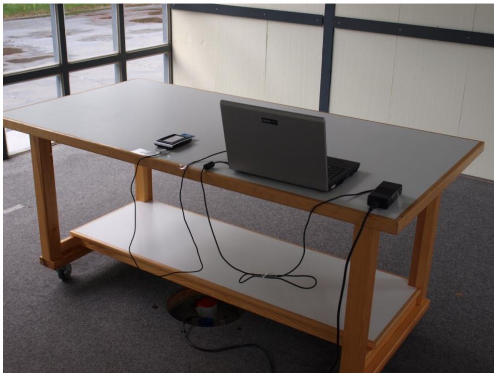
Picture 2: EUT test setup open site for spectrum mask and radiated emission test (rear)