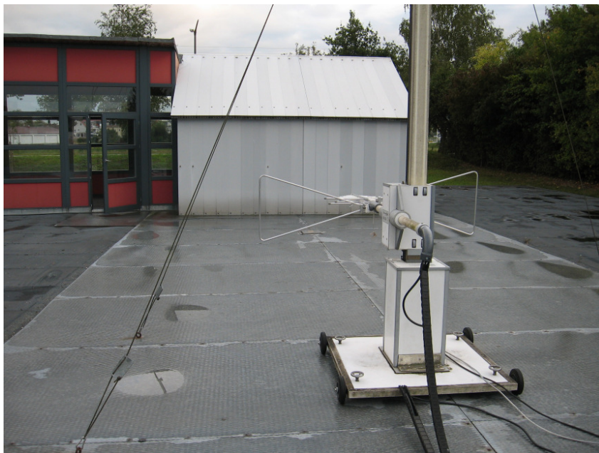
Picture 2: Broadband antenna in open site 10m for radiated emission test