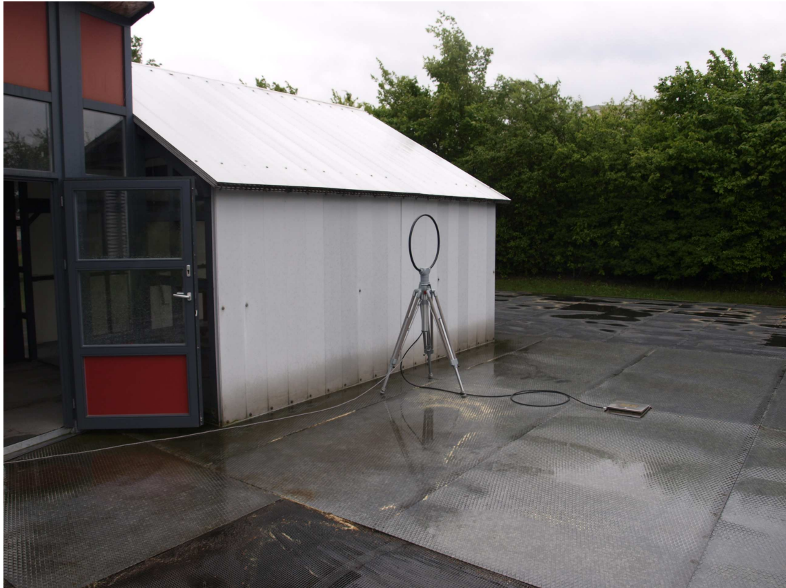
Picture 6: Loop antenna in open site 3m for spectrum mask and radiated emission test