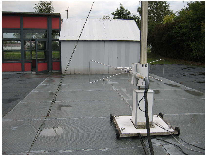
Picture 3: Broadband antenna in open site 10m for radiated emission test