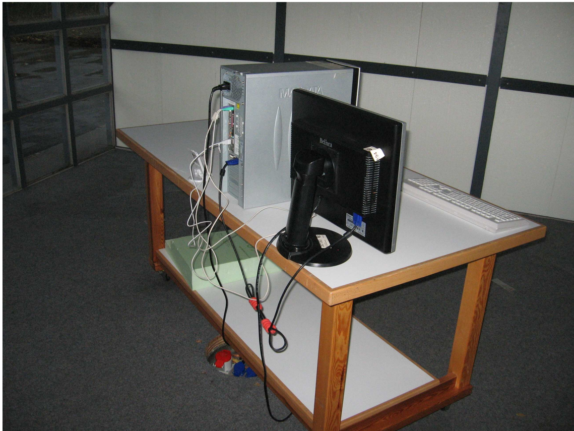
Picture 2: EUT test setup open site for spectrum mask and radiated emission test (rear)