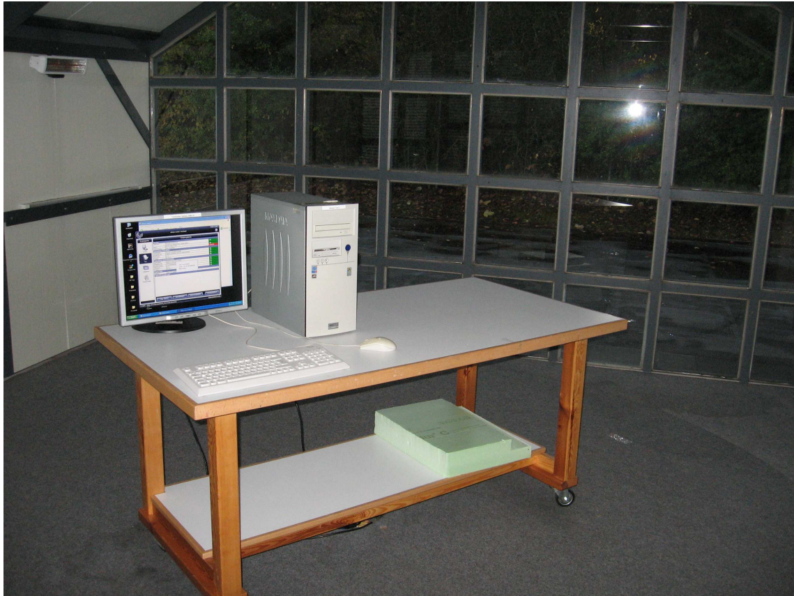
Picture 1: EUT test setup open site for spectrum mask and radiated emission test (front)