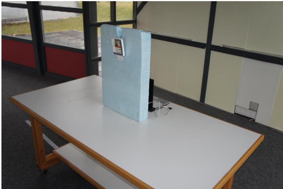
Picture 2: EUT test setup radiated emission test at open site (30MHz to 1000MHz)