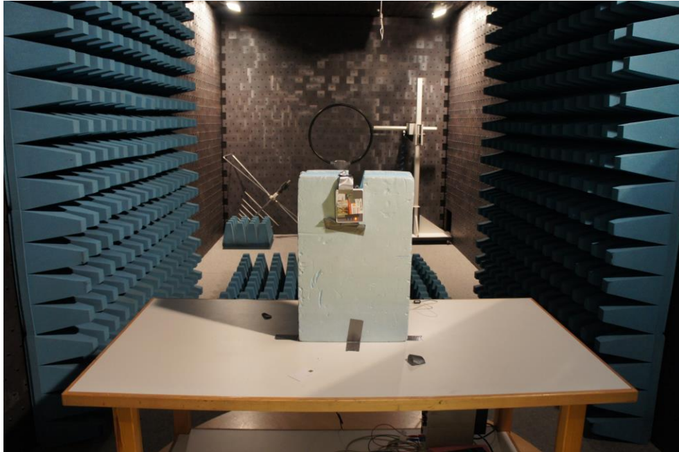
Picture 1: EUT test setup radiated emission With pre-measurements was the worst case test setup determined (9kHz to 30MHz)