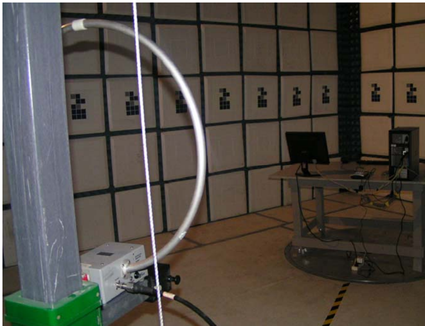
Low Frequency H-Field Radiated Test Set-up - Rear View