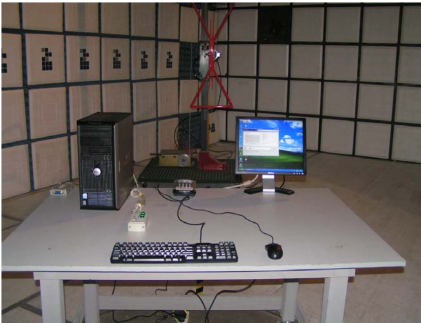
Maximized Radiated Emission Test Set-up - Back View