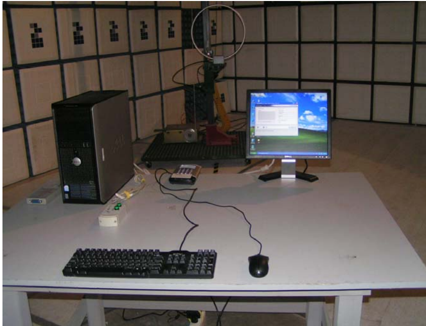
Low Frequency Radiated Test Set-up - Front View