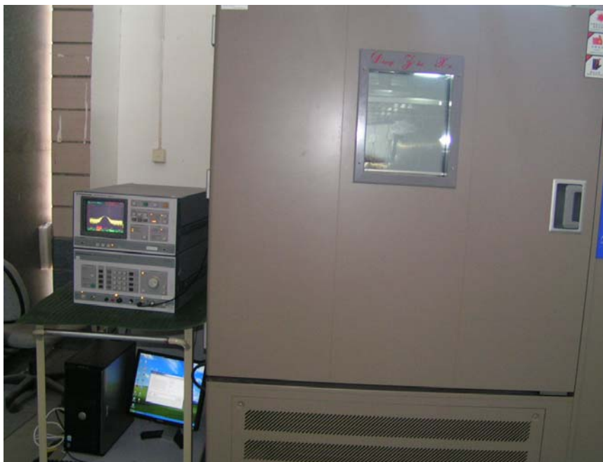
Frequency stability vs. Temperature Test Set-Up