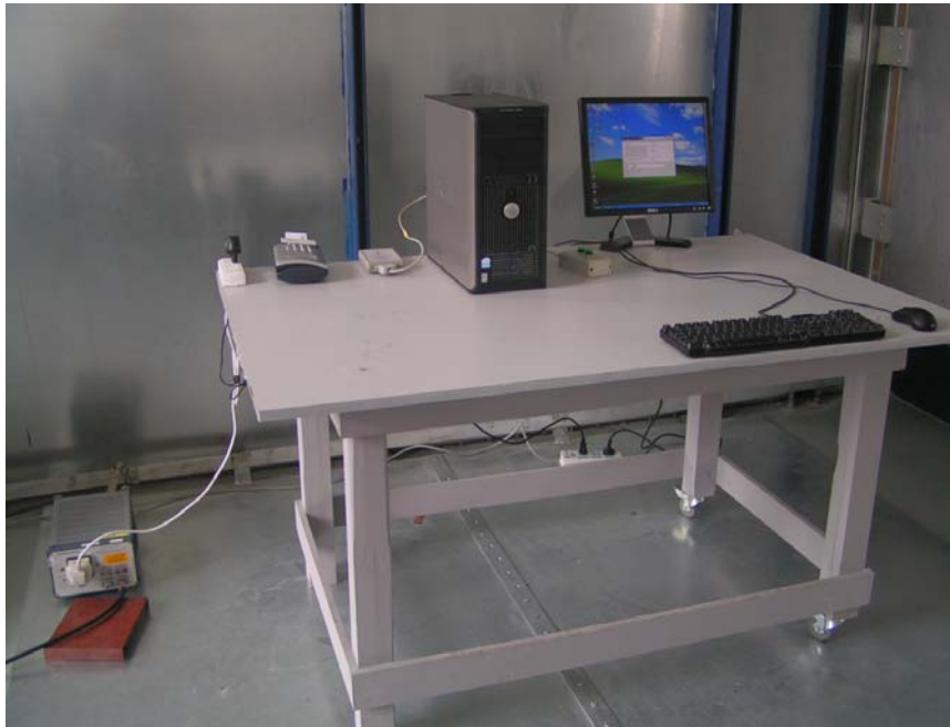
Conducted Emission Test Set-up