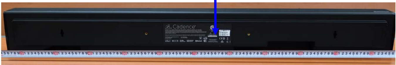
< Bottom of EUT >