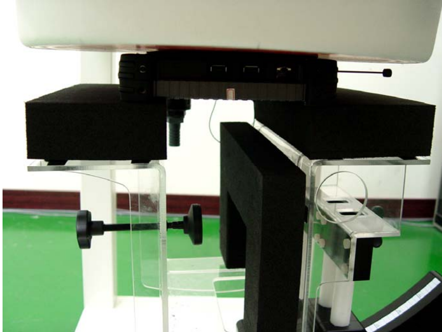
Rear Face with 0 cm Gap