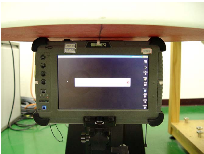
Bottom Side with 0 cm Gap