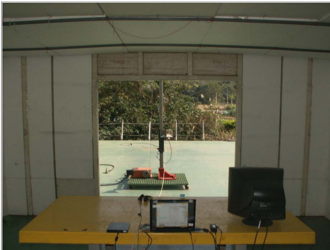
Rear View (Frequency above 1GHz)