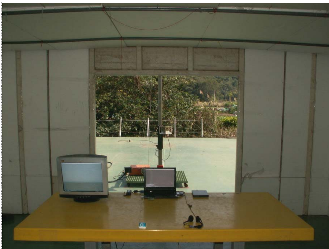
Front View (Frequency above 1GHz)