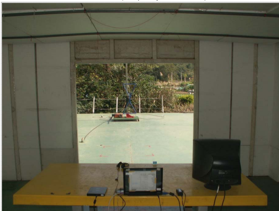
Rear View (Frequency under 1GHz)