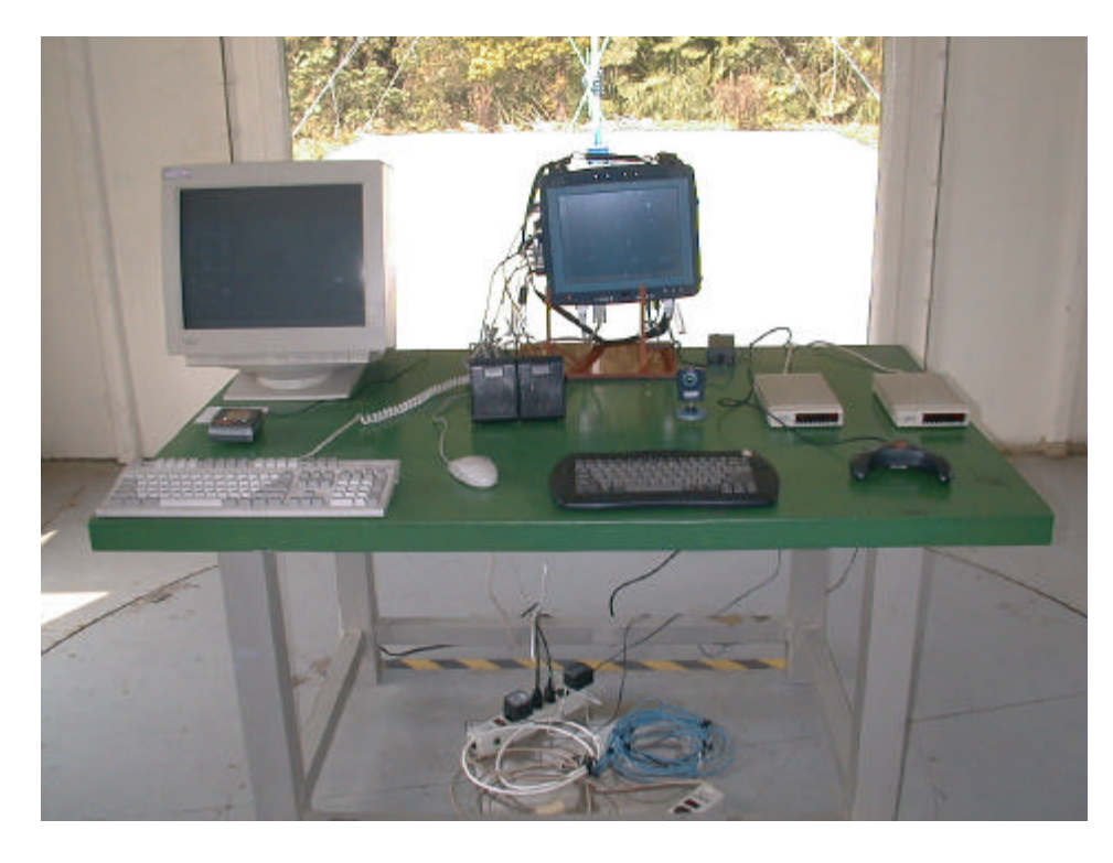
Back View of Radiated Test (Mode 1)