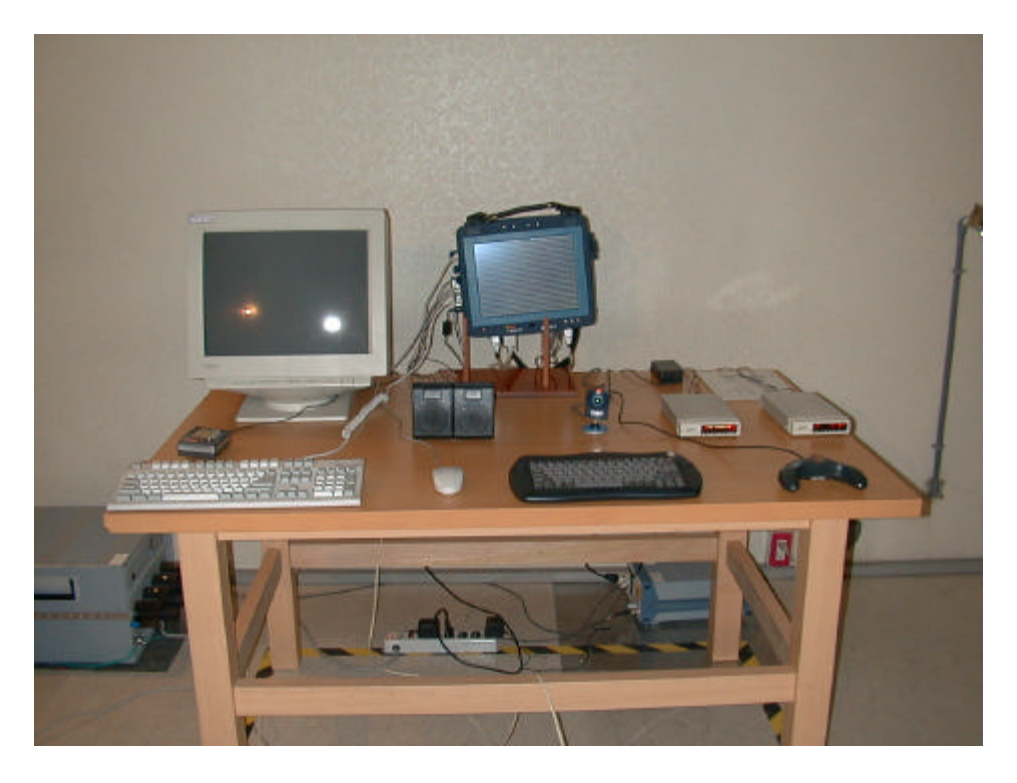
Back View of Conducted Test (Mode 1)