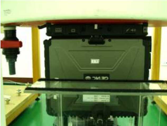
Bottom of the host PC (Sample 1) with 0 cm Gap for Laptop Mode