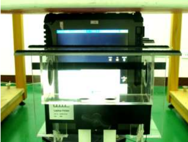
Primary Portrait of the host PC (Sample 1) for Tablet Mode