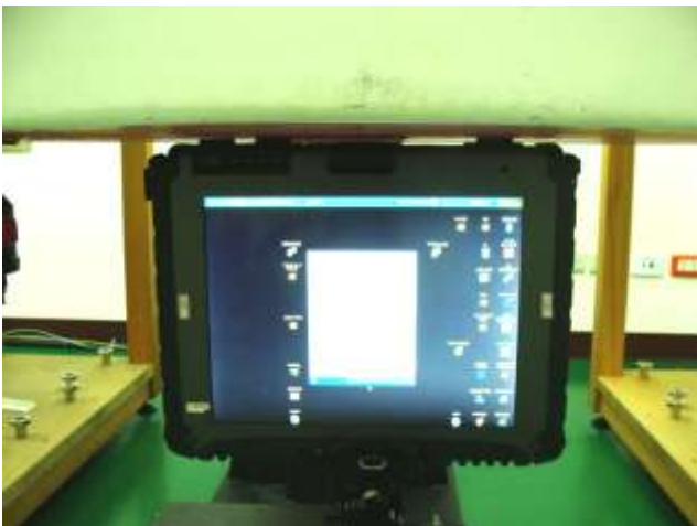
Primary Landscape of the host PC (Sample 1) for Tablet Mode