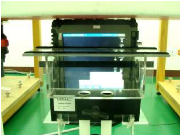
Primary Portrait of the host PC (Sample 2) for Tablet Mode

Note: The DUT was installed into the host PC, Convertible Tablet (Brand Name: GETAC / Model Name: V100) during the test.