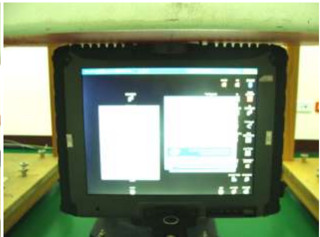
Secondary Landscape of the host PC (Sample 1) for Tablet Mode