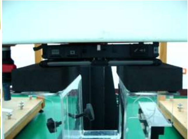
Bottom of the host PC (Sample 1) with 0 cm Gap for Tablet Mode