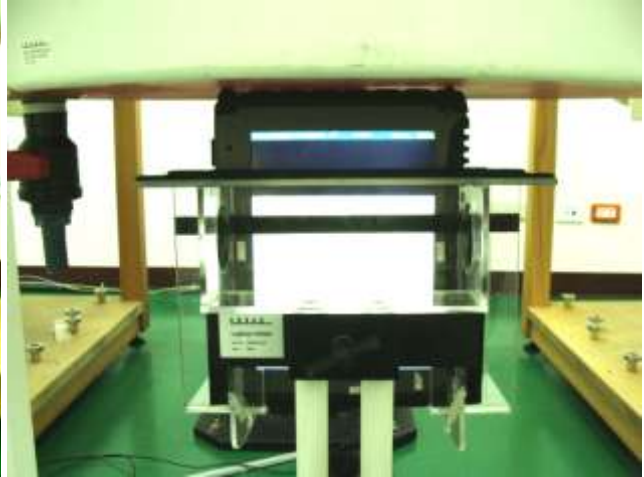
Secondary Portrait of the host PC (Sample 1) for Tablet Mode