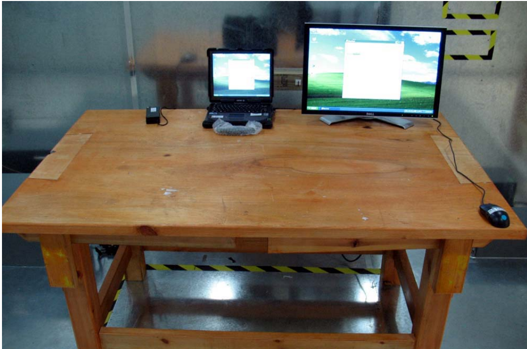
The Front View of Highest Conducted Set-up For EUT