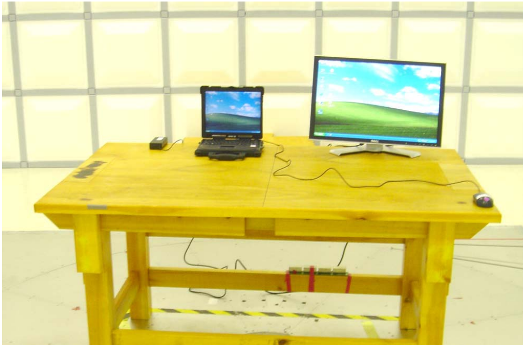
The Back View of Highest Radiated Set-up For EUT